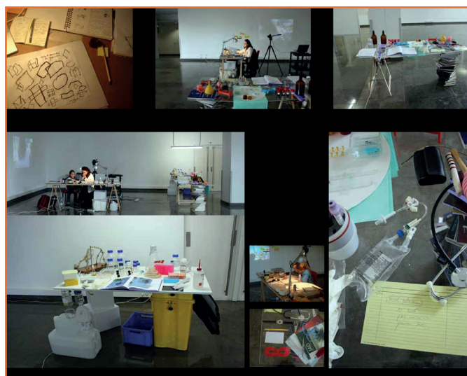
Figure 4. The Archive: Enactment/Re-Enactment of the Archive. Performance at IMM, 18–25 March.

As noted, medical assessment through visual evidence is associated with specific cultural practices and 'modes of seeing' (Sturken and Cartwright, 2002, chapter 8). Science has thus been interpreted as a process of generating 'drawings' that increasingly accumulate and circulate, rather than observing the natural world.