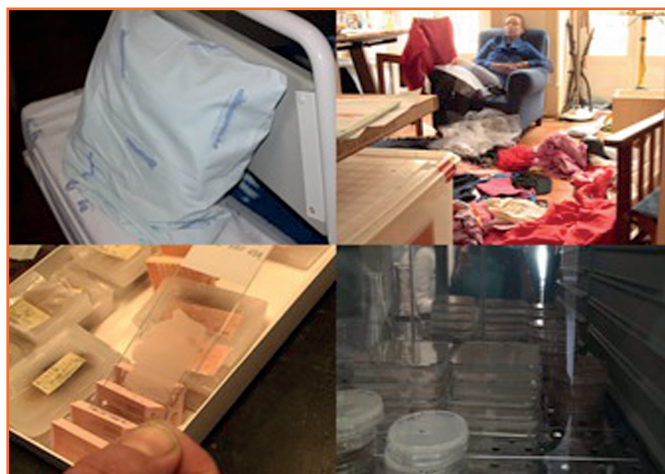
Figure 1. 'The four virtual archival spaces.'

In my research process, I have documented the assessment and categorization of Alzheimer's patients and their exposure to various therapies. I have also documented molecular and cellular research laboratory procedures and collected laboratory materials. In order to maintain a common thread when approaching these spaces, methods have focused on neuroscientific diagnostic images (MRI and PET scans), graphs, diagrams, notes, models, photographs, instruments, physical space conditions and hybrid forms of these, and establishing a critical link to art practice (Figure 1). In laboratory studies, these visual approaches are referred to as representational strategies or practices (Lynch and Woolgar, 1990: 1-18).