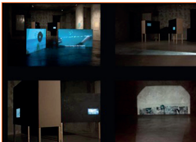
Figure 6. The Therapy . Exhibition Uma coisa entre muitas . Museu Nacional de Historia Natural e da Ciência, Lisbon.

an affinity with viewers because it holds a metonymic relationship to their own body. I exploit the material quality of the real brain disappearing by experimenting with the vanishing, dissolution and perpetual becoming of the image through deliberate out-of-focus effects and/or digital manipulation.