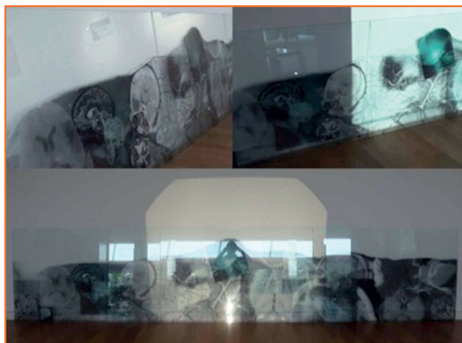
Figure 2. The Approach . Exhibition A Arte do Cérebro, Centro Cultural da Figueira da Foz.

feelings, context and time (re-enactment of the archive). The Approach (Figure 2) explores assembly and movement of images and experiences between the various spaces, whether organized and almost aseptic (the laboratory or the gallery) or highly emotional and almost chaotic (the hospital and the studio).