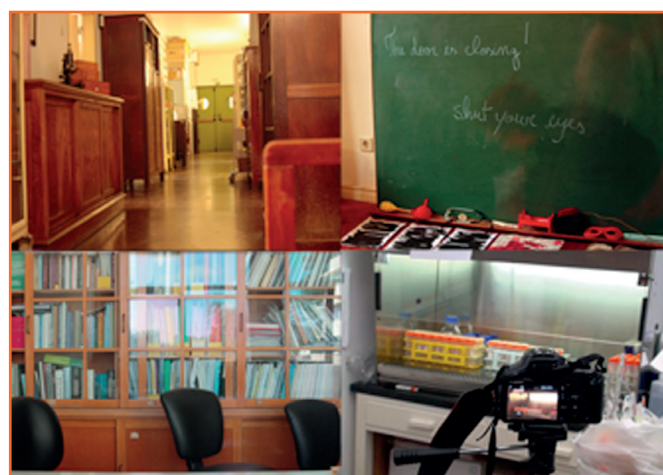
Figure 3. 'The four virtual archival spaces.'

In this circulation, fragments or traces (Derrida, 2010) are both produced and collected, disrupting a temporal assumption that links the part to the whole through deferral, the past to the present. My copies of archival fragments of neuroscientific records or direct records of laboratory sessions relate to something other than themselves, thus functioning at the level of evocation or memory. Engaging with Michel Foucault's understanding of the archive in the medical arena, I explore how the archive 3 can establish a complex set of relations.