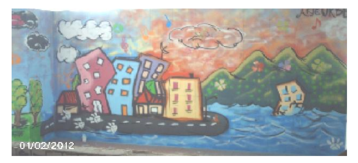
Photo 3. Graphite produced by young participants in one of the editions of Project ArteUrbe.

These other activities are relied on contributions in the area of social psychology that consider the possibility of thinking the group practices "as gadgets^3 – singular combinations and heterogenic components – that open certain fields of visibility and sayability, at the same time they obscure analog fields" (Rodrigues, 1999, p.162). The visibility and sayability that is aimed to invest in aesthetic workshops are from other voices, discordant in relation to forms of seeing and living instituted; voices that concern the possibility of diverse relations with the city, with others and with oneself; that contribute to the invention of singular ways of being, with the come to be.