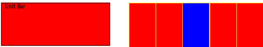
Figure 1. Java Bars.

During the project, the students had opportunities of using different types of manipulatives to understand fractions on the number line (Figures 1 and 2). The idea of equipartitioning of a whole unit by using Java Bars (Figure 1) was introduced in the beginning of the fractions unit. Later, instructors facilitated concrete meaning of the number line by using the Cuisenaire rods (Figure 2). The students showed different fractions by using the manipulatives and named different colored rods by answering questions: "if yellow rod is called 1 unit, what would we call the white rods?" The students worked on drawing their own number lines using the Cuisenaire rods.