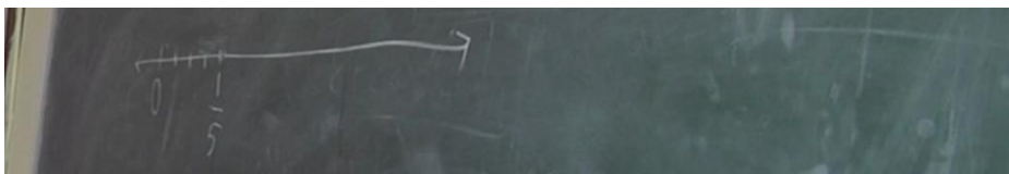
Figure 3. Representation related to the task “Locate 1 (one whole) on the number line by paying attention to precision.”

The TR asked the students to draw a number line where 0 and \frac{1}{5} are separated by 4 squares and locate 1 by paying attention to precision (counting the number of squares on their notebooks) (Fig. 3). Although about one third of the class understood how fractions may be represented on number lines, the rest struggled with understanding how number lines may be used to represent equipartitioning of a whole, iterating unit fraction to identifying one whole and equal intervals on a number line. The TR walked around classroom and saw that most students had problems in understanding the task. She asked a high achieving student in class, Nadia to explain her reasoning in front of the board.