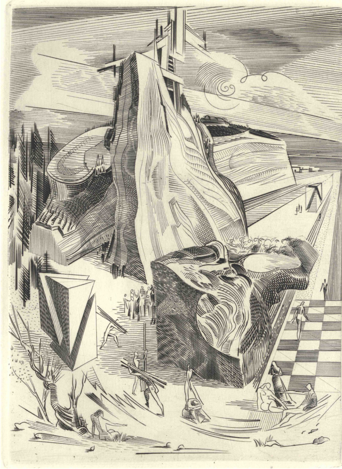
Plate “Le nid d’aigle” (Bachelard &amp; Flocon, 1957: Fig. 5 in source).

In view of these comments, it will hardly be surprising to find that in Le rationalisme appliqué — one of his epistemological works of the second series, around 1950 — Bachelard not only attributes an “abstract-concrete mentality” to the physics of his era, but also describes his own philosophy concerned with that mentality as a “philosophy at work” or “philosophy of work” ( philosophie au travail ), as opposed to what he dismissively calls the “philosophies of synopsis” ( philosophies de résumé ) of his predecessors and contemporaries. (Bachelard, 1949: 1, 9). And Bachelard sees Flocon’s incisions with the burin as “a symbol of the rock drill penetrating the resistant depths. From the moment of its very first, sketchy movement against a hard