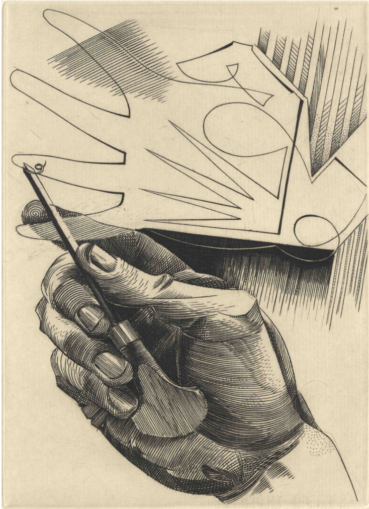
Bachelard et al, 1949: Fig. 7 in source.