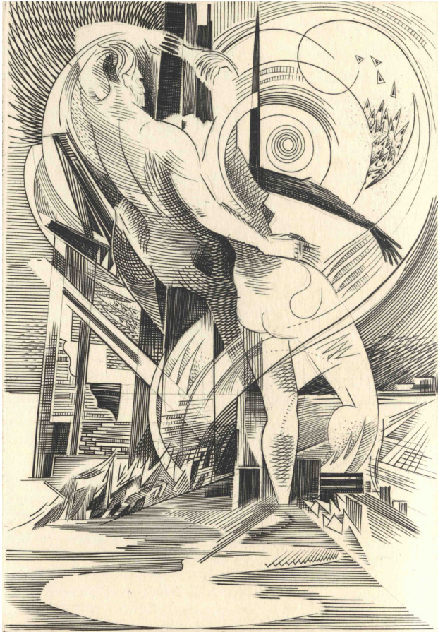
Bachelard & Flocon, 1950: Fig. 4 in source.

At first glance we seem to be looking at figures that have grown together to form a single, conjoined body. On closer inspection, however, the figures become distinct with the hands playing a central role once again. To some extent they embody the movement of the dancing couple. The two hands pointing upward come together to form a closed circle that simultaneously becomes a ring of fire. The hands reaching outward lead the way at the same time as holding the balance. For all the specific dynamic of fire, these hands, each stylized into characteristic gestures, lend the picture a playful and relaxed aspect in the midst of the magic of the sparks.