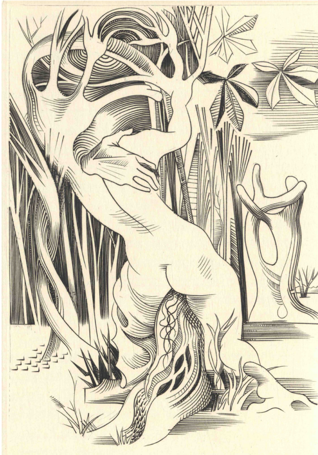
Bachelard & Flocon 1950: Fig. 5 in source.

But it is not only vegetable and human forms that continually intertwine. Another characteristic feature of this engraving is that forms perpetually grow out of interstices and that figurations are transformed into interstices again.