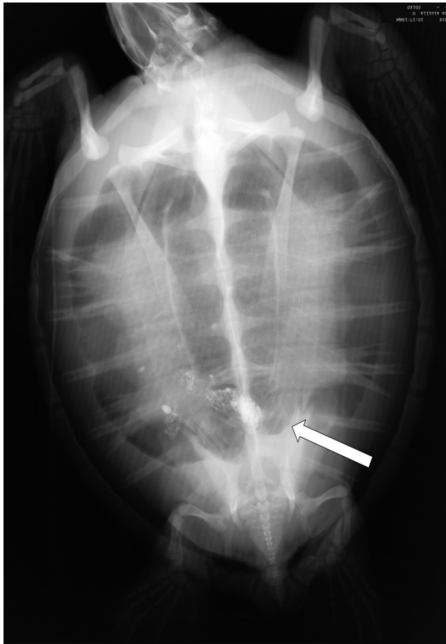
Figure 2. Radiographical investigation of the studied specimen highlighting the presence of some foreign bodies compatible with mineralized debris in the distal portion of the digestive tract (white arrow) / Investigación radiográfica del espécimen estudiado resaltando la presencia de algunos cuerpos extraños compatibles con restos mineralizados en la porción distal del tracto digestivo (flecha blanca)

The performed radiographic investigation showed the presence of some foreign roundish bodies in the intestinal tract of the turtle (Fig. 2). These may be likely attributed to mineralized debris. The presence of allochthonous material in the digestive tract of the specimen is noteworthy since the danger that this may constitute for the green turtle is well-known (Schuyler et al. 2013).