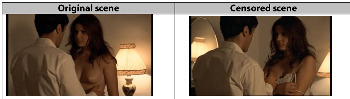
Illustration 1. Example of a sexual scene censored in the film El Padrino

Also concerning sexuality, in reel 13 and on the wedding night, Apollonia, Michael's bride, gets undressed and her breast is visible. In the case of the novel this scene was also deleted as explicit nudity was still prohibited. In the film, an alternative take was used and the scene ends when Apollonia makes the gesture of lowering her bra straps, as can be seen in Illustration 1: