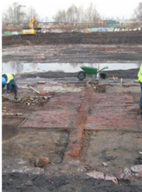
Figure 5. Box beds (reproduced with permission of HAPCA).

Outbuildings were uncovered next to the northern and southern range, but archaeologists were unable to suggest a function for these buildings due to a lack of material finds across the site and the structures not being identified on maps. Mrs Wilson provided memories which interpreted the outbuildings and without her testimony the identity of these buildings would have remained hidden. When asked about the outdoor space on the site Mrs Wilson advised the area between the houses was open, that at the top of the main road there was a stable and shelters for horses, a kippering store and a blacksmiths.