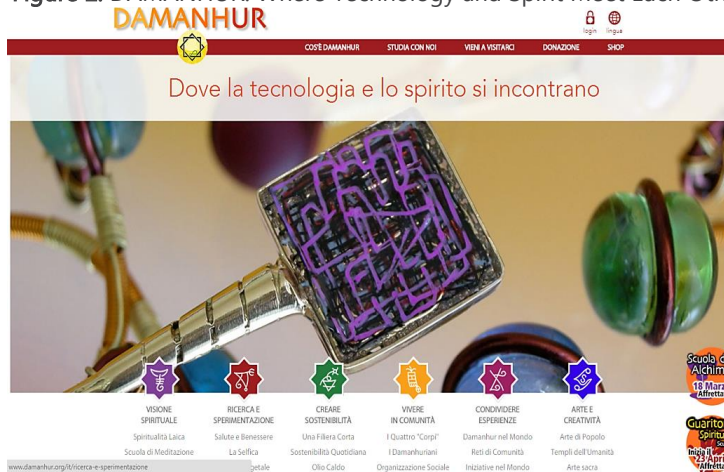
Figure 2. DAMANHUR. Where Technology and Spirit Meet Each Other.

Ant: The new website should reflect the completeness and unity of Damanhur's society. You will find our founding pillars listed on the homepage: the spiritual vision, research and experimentation, sustainability, community life, sharing of experiences, art and creativity [see Figure 2].