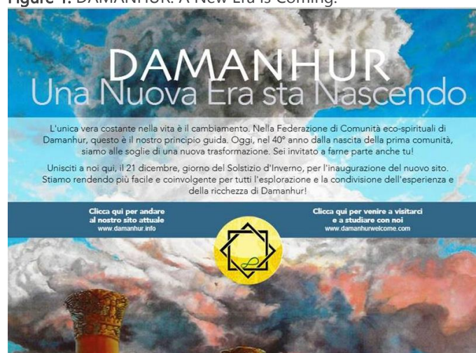
Figure 1. DAMANHUR. A New Era is Coming.

Translation: "The only real constant in life is changing. In the Federation of eco-spiritual Community of Damanhur, this is our guiding principle. Today, on the 40th anniversary of the birth of the first community, we are on the threshold of a new transformation. You are invited to be part of it too! Join us here on December 21th, day of the Winter Solstice, for the inauguration of the new site. We're making easier and more engaging for everybody exploring and sharing the experience of Damanhur and its richness!".