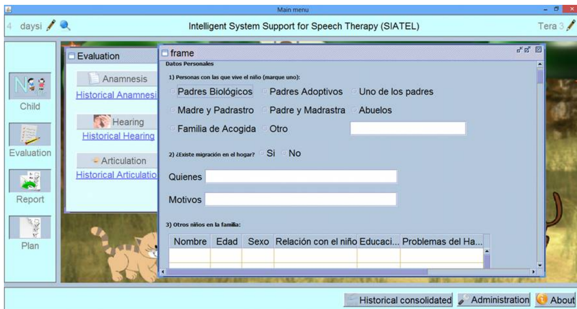
Figure 4. A screen capture of the anamnesis menu of the desktop application.