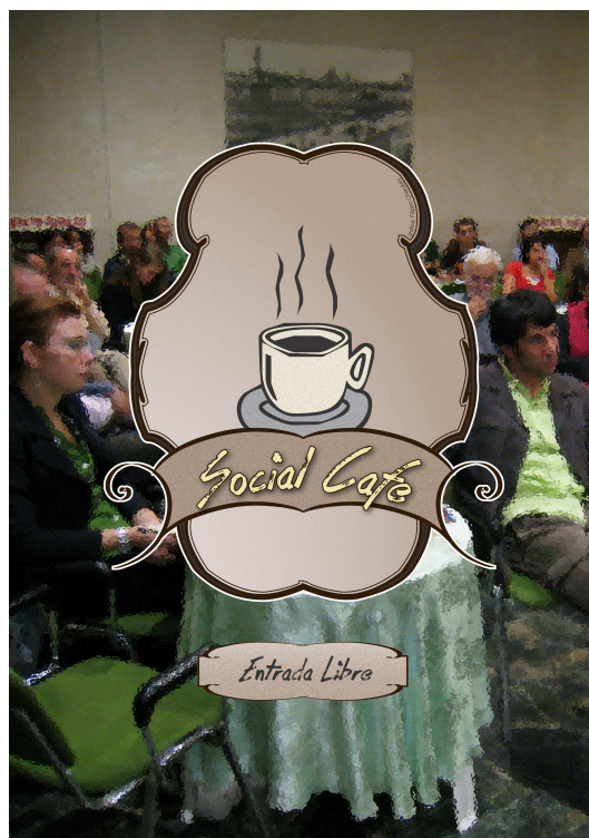
Figure 2. Possible logo for a Social Caf e.

The venue may be any public place with free entrance where guests, moderator and public are on the same plane, literally. More precise recommendations would be useless, this point being strongly dependent on the region where events are organized.