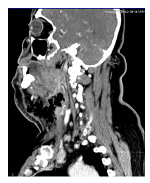
719-2479 - www.joralres.com © 2017

Primary Care Service, where he was diagnosed with acute tonsilitis and prescribed penicillin.