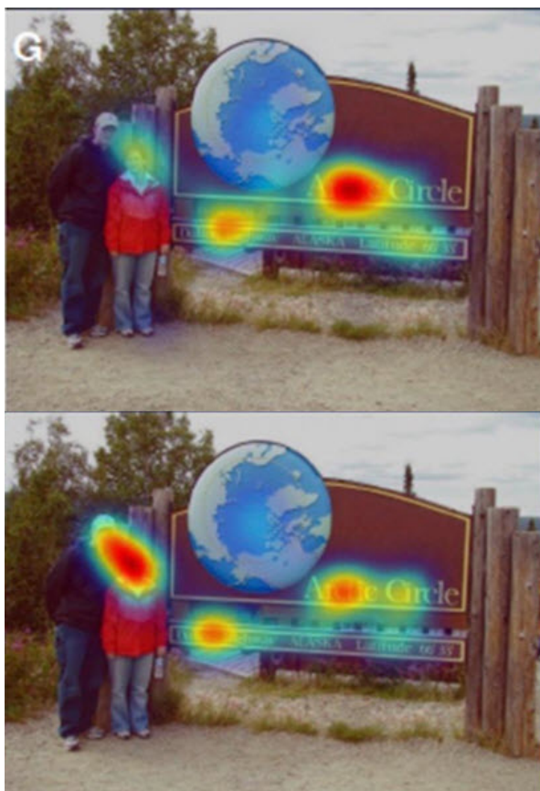
Figure 1. The trajectory of view of people with ASD in comparison to the look of “ordinary” people.

brazheniya pokazyvayut, kak autisty vidyat mir [These images show how autistics see the world]).