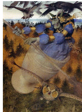
Figure 4. Baba Yaga. Illustration for the children’s book. The artist is G. Spirin. http://vladmama.ru/forum/viewtopic.php?f=585&t=202523

Children with ASD and mental retardation (MR) almost do not pay any attention to background details, especially small ones. So, they spotted flying birds in the foreground, but the image of the lakes in the background were not noted. In another picture, only the central figure of the cat was marked by a child with ASD and MR, and other cats, shown on the right and along the perimeter, went left unnoticed, perhaps they seemed insignificant to the child with ASD and MR, or merged with the background. On the other hand, a rooster and a kitty, depicted along the perimeter of the picture, were carefully described. However, the central figure was left unattended. Noteworthy, that 40% of children managed to exhibit the ability to perceive both the background of images, including a reduced format, and performed the description with less accuracy (children counted houses, specified that there was snow in the street, etc.).