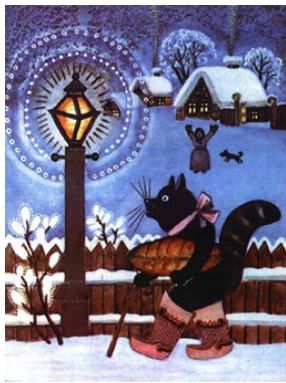
Figure 5. Koten'ka Kotok. Illustration in a children's book. Artist Y. Vasnetsov http://miryanin.narod.ru/vasnecov3.jpg

In the course of the study children with ASD and mental retardation made a lot of errors. For example, they called storks geese, which flew in jamb. They called dogs deer, who were harnessed to a team. The castle looked like Moscow (linked to the image of the Kremlin), they called a dwarf Santa Claus, and a cat – a wolf, a squirrel – a fox, a girl – a grandmother, etc.