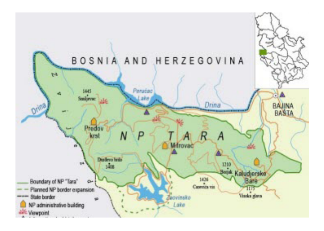
Figure 1. Map and position of the National Park Tara in Western Serbia

The National Park Tara covers most of the mountainous Tara region in the far west of Serbia, on the border with Bosnia and Herzegovina (Republic of Srpska). Tara is linked by the Drina valley from the north and west, the Rzav valley from the southwest, and by the Kremna valley from the south that separates it from the Zlatibor plateau. Mountain space is a unique geographic unit, about 45 km long and up to 18 km wide in the central part of the mountain and the average altitude of 1 200 m (Figure 1).