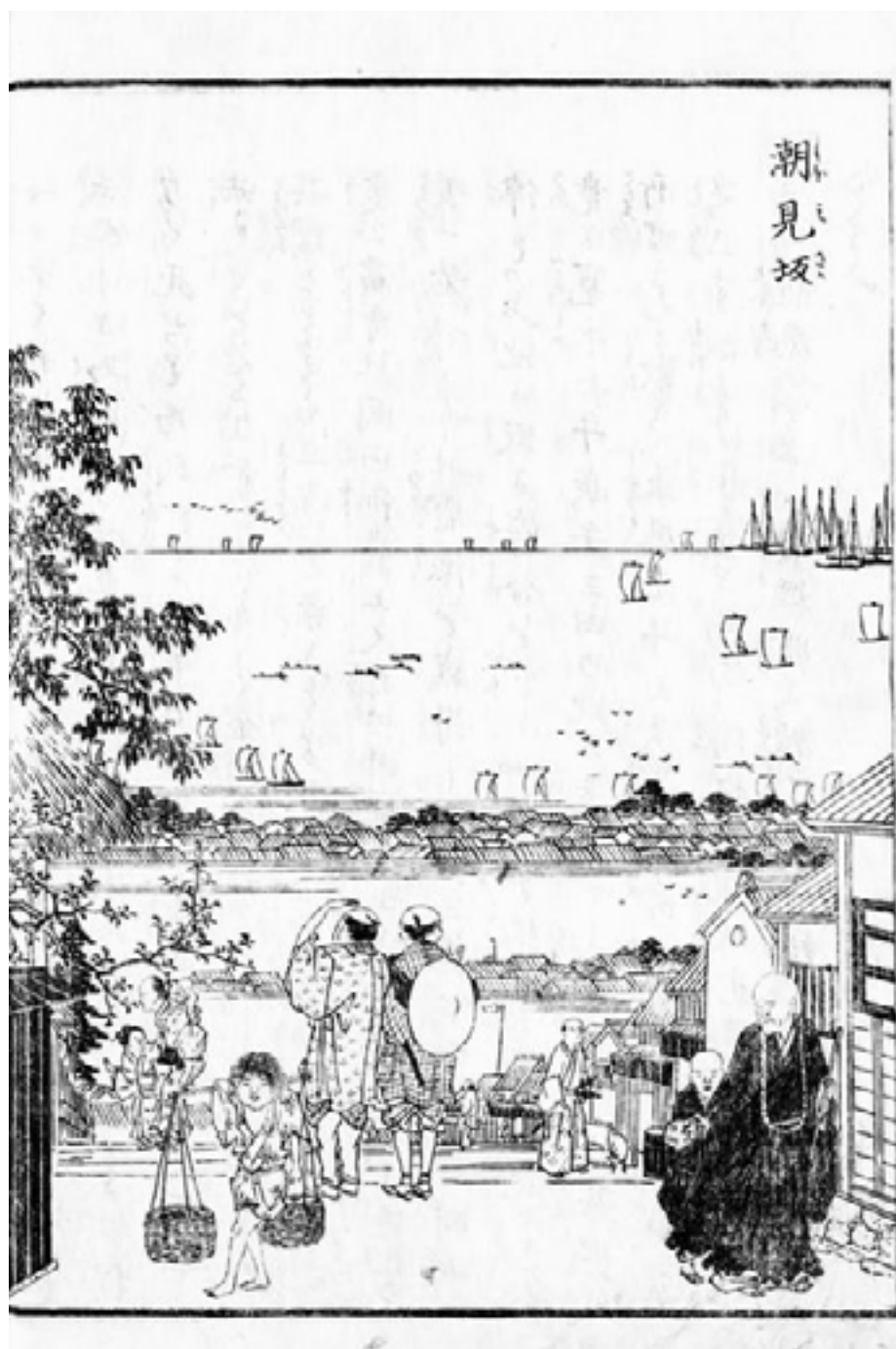
Figure 5. Shiomizaka. Sloping street overlooking Edo bay.