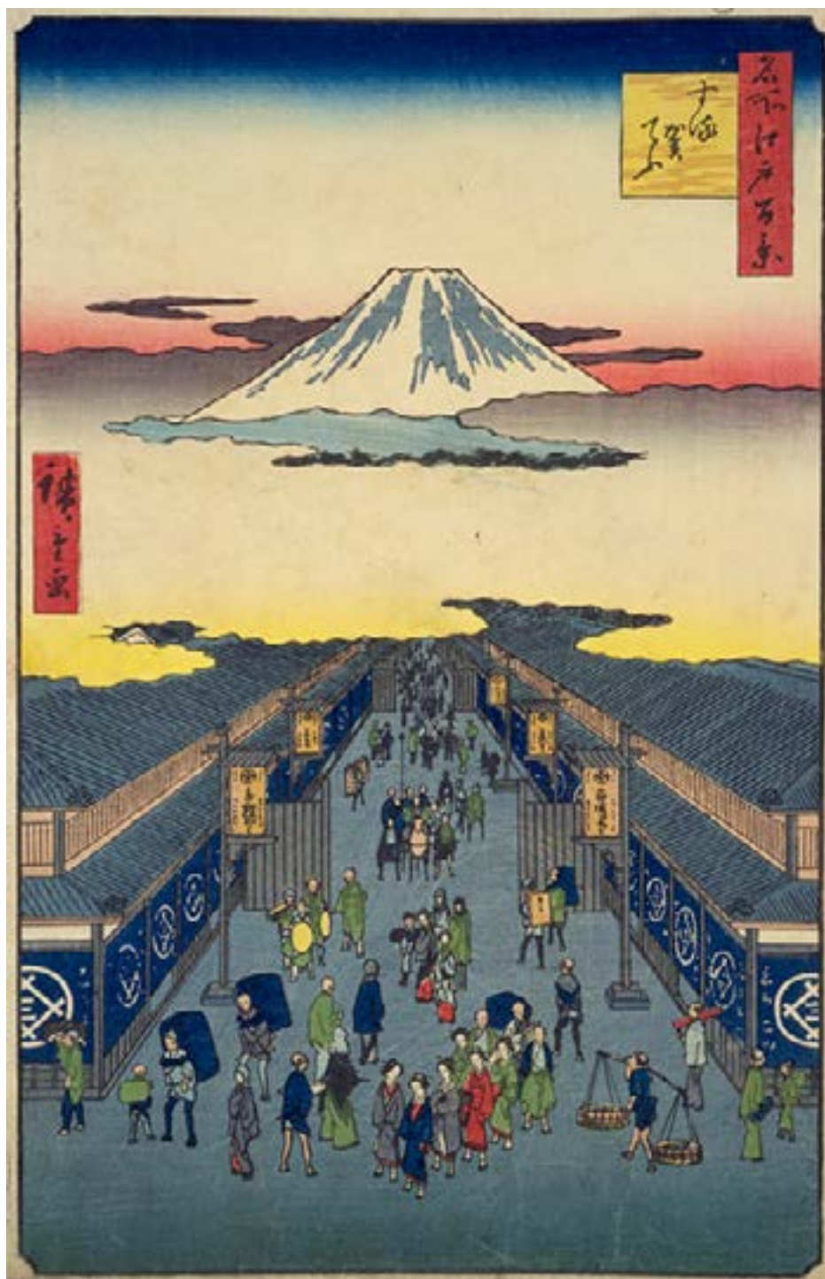
Figure 4. Surugacho, Hiroshige. An Edo street overlooking Mt. Fuji.