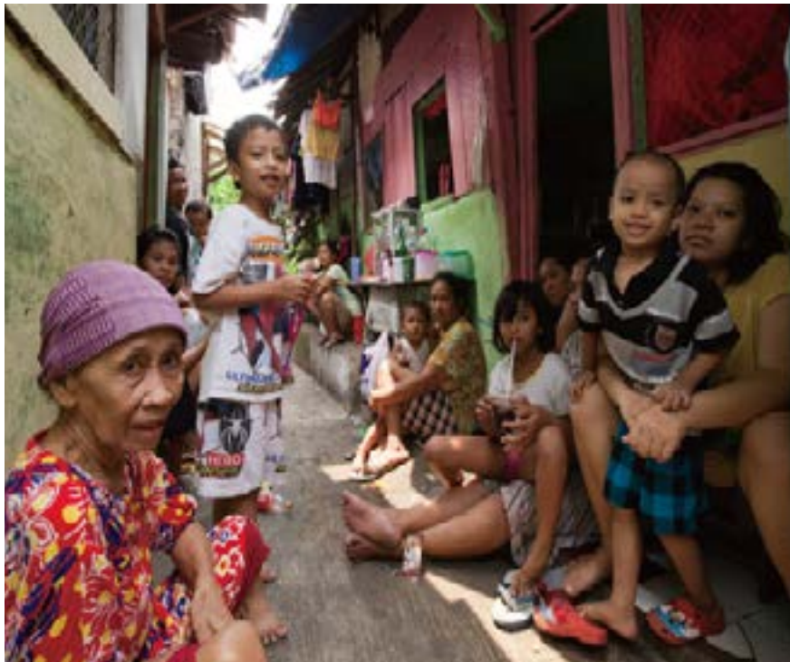
Figure 2. An alley in kampung Cikini.

is surrounded by redeveloped, modern districts. It has a density of around 1,000 people per hectare. Cikini was originally a village of between twenty and forty families scattered across a green area beside the river. But one consequence of densification is the loss of unbuilt areas. A very fine network of narrow alleys now covers the whole area, giving it four times the 'surface area' of the city's planned districts. The alleys are constantly full of women and children [fig.2]; this is where the women cook and chat together while their children play. The narrow alleys and small open spaces are relatively comfortable in the hot humid monsoon climate; they are cooler than large open spaces because of the shade. Families are used to living together with their relatives. The original family house is usually bigger, and its front yard and perhaps its living room are spaces shared by the relatives and are often open to everyone. The network of narrow alleys and spaces open to neighbors acts as a space for social relations and mutual help. They may be defined as public spaces adapted to the monsoon climate. By necessity, the shape of public space in the Asian monsoon culture tends to be endless, long, narrow and extended.