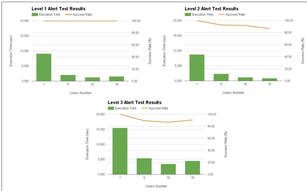
Figure 3. Experimental prototype test results.

In order to evaluate the performance of the experimental prototype, twelve tests were conducted observing the execution time (how much time the service needs to complete all its processing for each user) and the success rate (how many users successfully received the service). Considering that this prototype is aimed for eight users, three tests were performed considering three different alert levels: level 1 for low risk alerts, email and twitter post; level 2 for medium risk alerts, email, twitter post and SMS; level 3 for high risk alerts, email, twitter post, SMS and voice call. Each test was repeated ten times and is divided according to the number of users (1 user, 5 users, 10 users and 15 users). Figure 3 illustrates the results obtained in the tests performed. The orange line stands for the success rate in terms of percentage and the green bars stand for the execution time measured in seconds and is divided according to the user's number in each test performed.