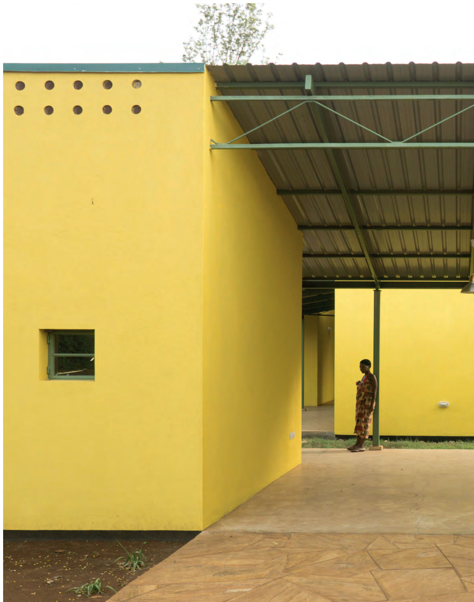
Circulación y conexión entre patios