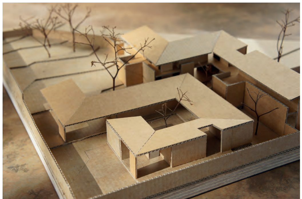
Maqueta del proyecto