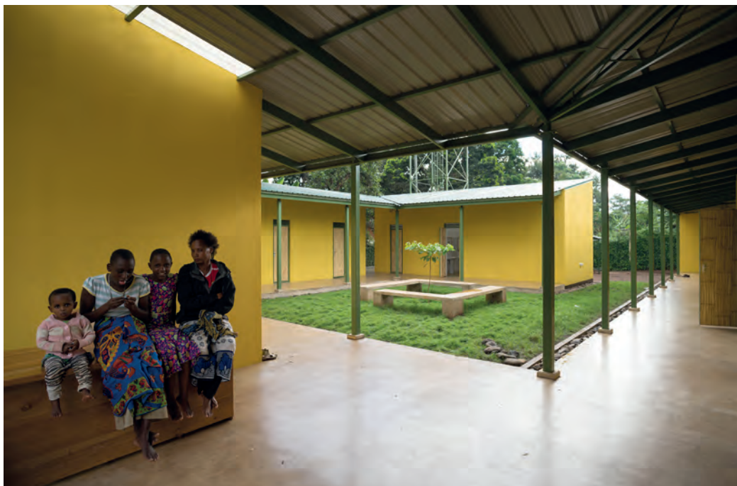
Patio del proyecto