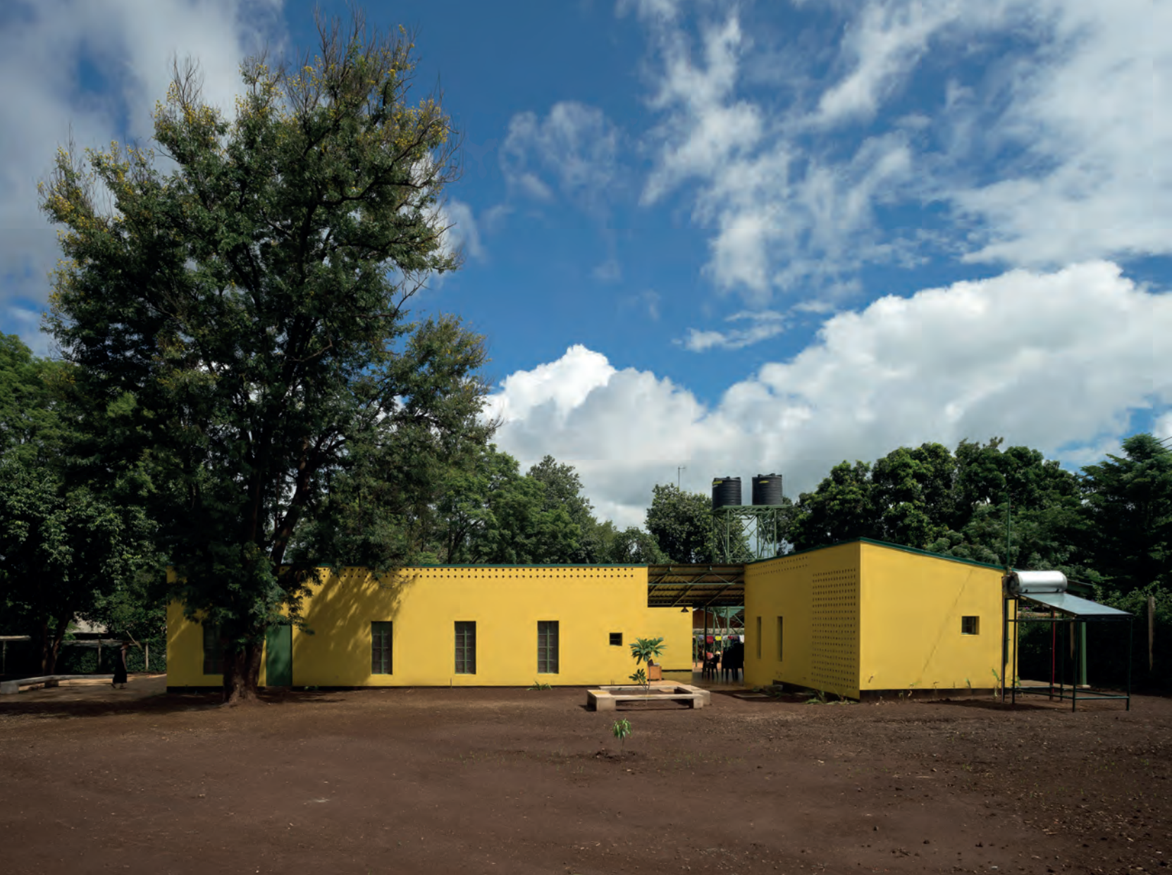
Fachadas del proyecto