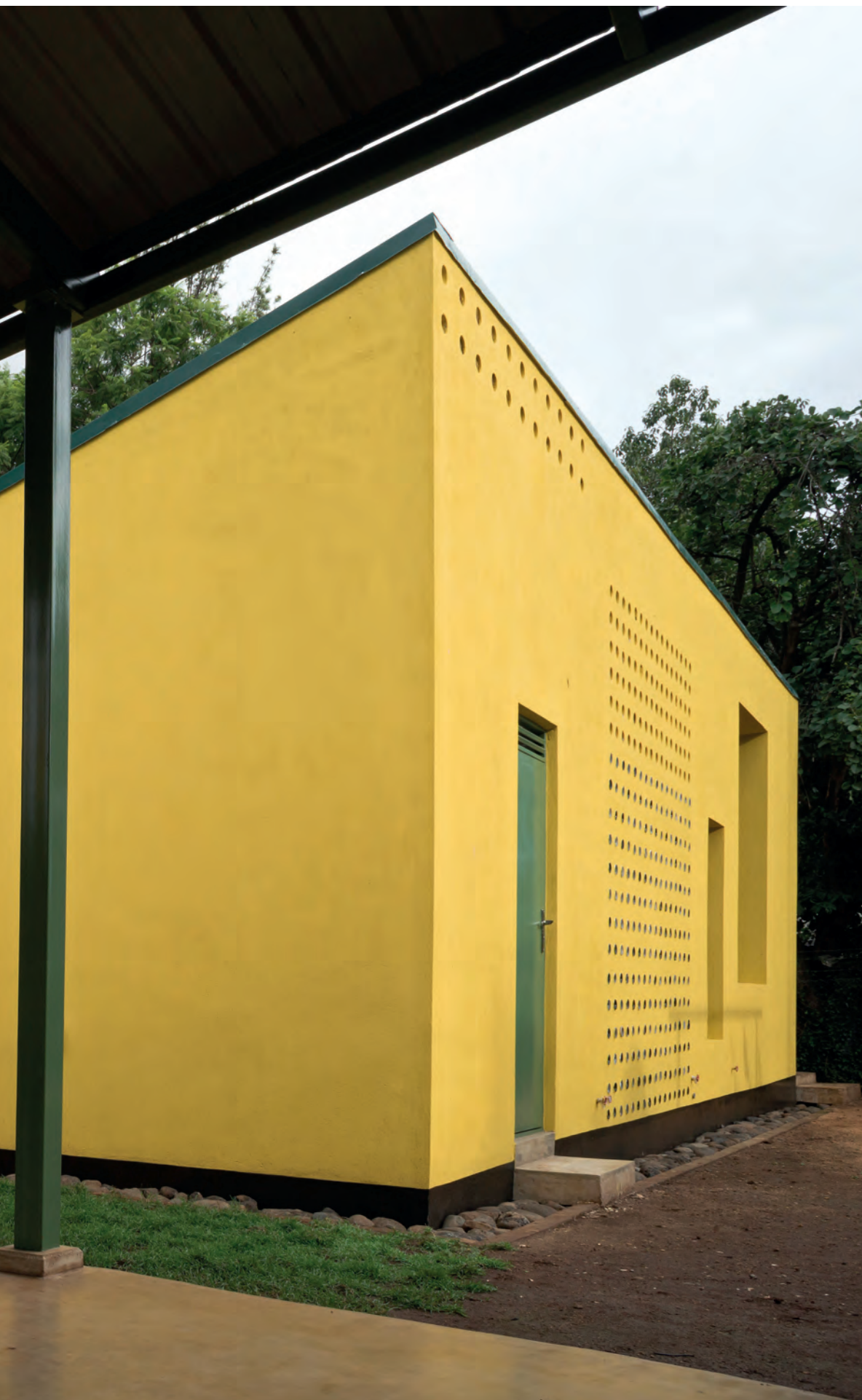
Circulación y patio interior