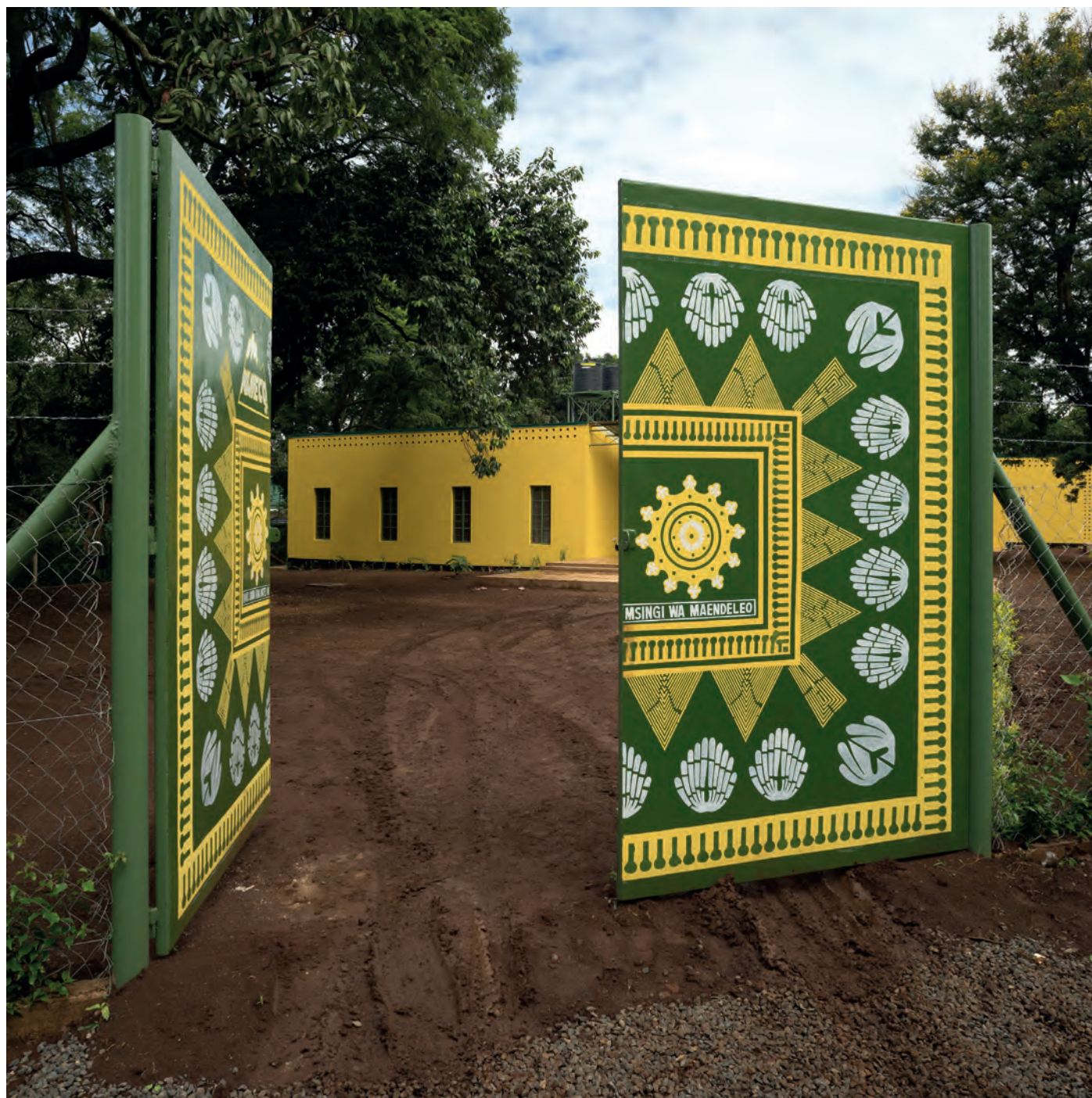
Acceso secundario del proyecto