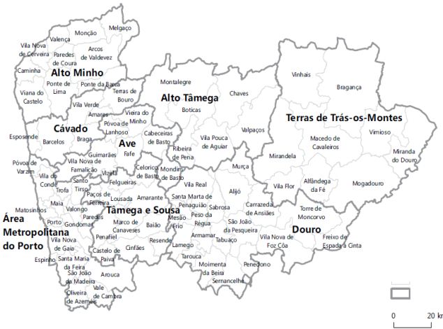
Figure 2 - NUTS II territorial division of the Norte region, NUTS III and municipalities

administrative divisions at the municipality level – the territorial units of reference for the majority of the information made available for this study – are those created by the administrative reorganisation, in use since 30 September, 2013. The NUTS II territorial division of the Norte region, NUTS III and municipalities are presented in Figure 2.