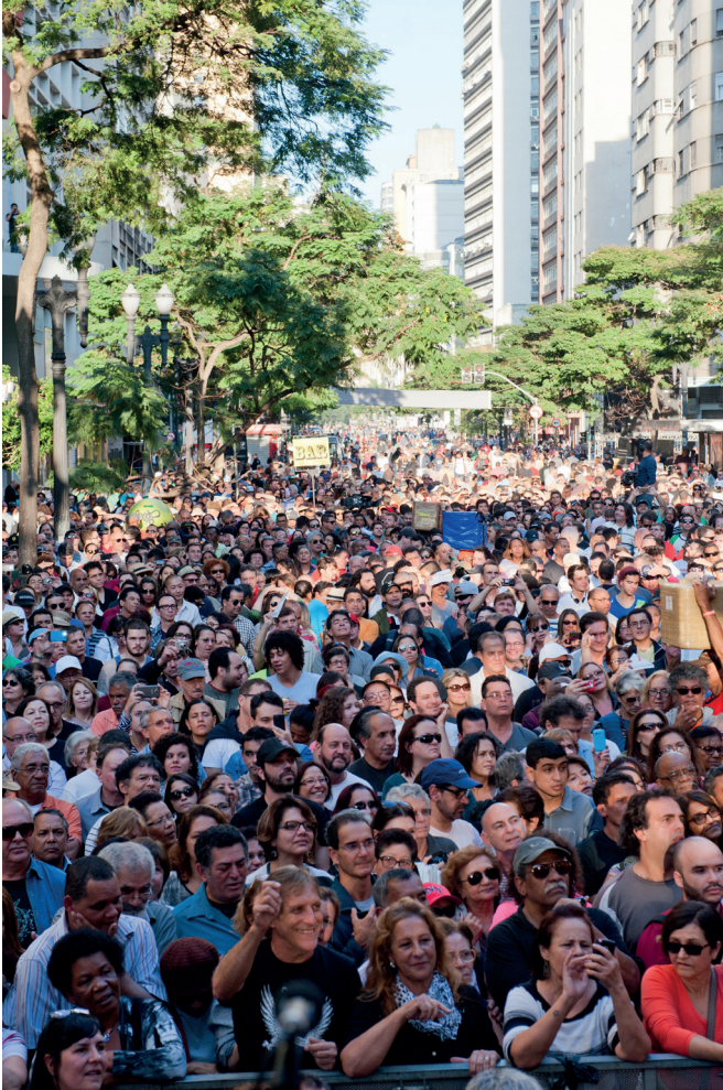
Image 2. “Virada Cultural” (24-hour cultural event) in the São Paulo central area