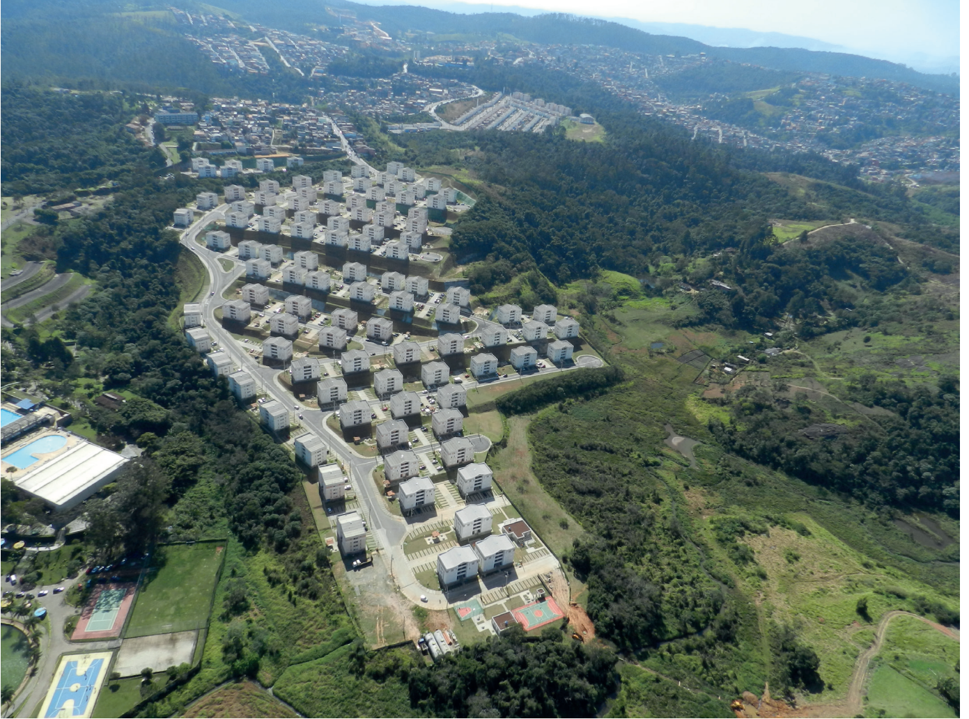
Image 4. Housing complex in Heliópolis slum. Architect: Hector Vigliecca