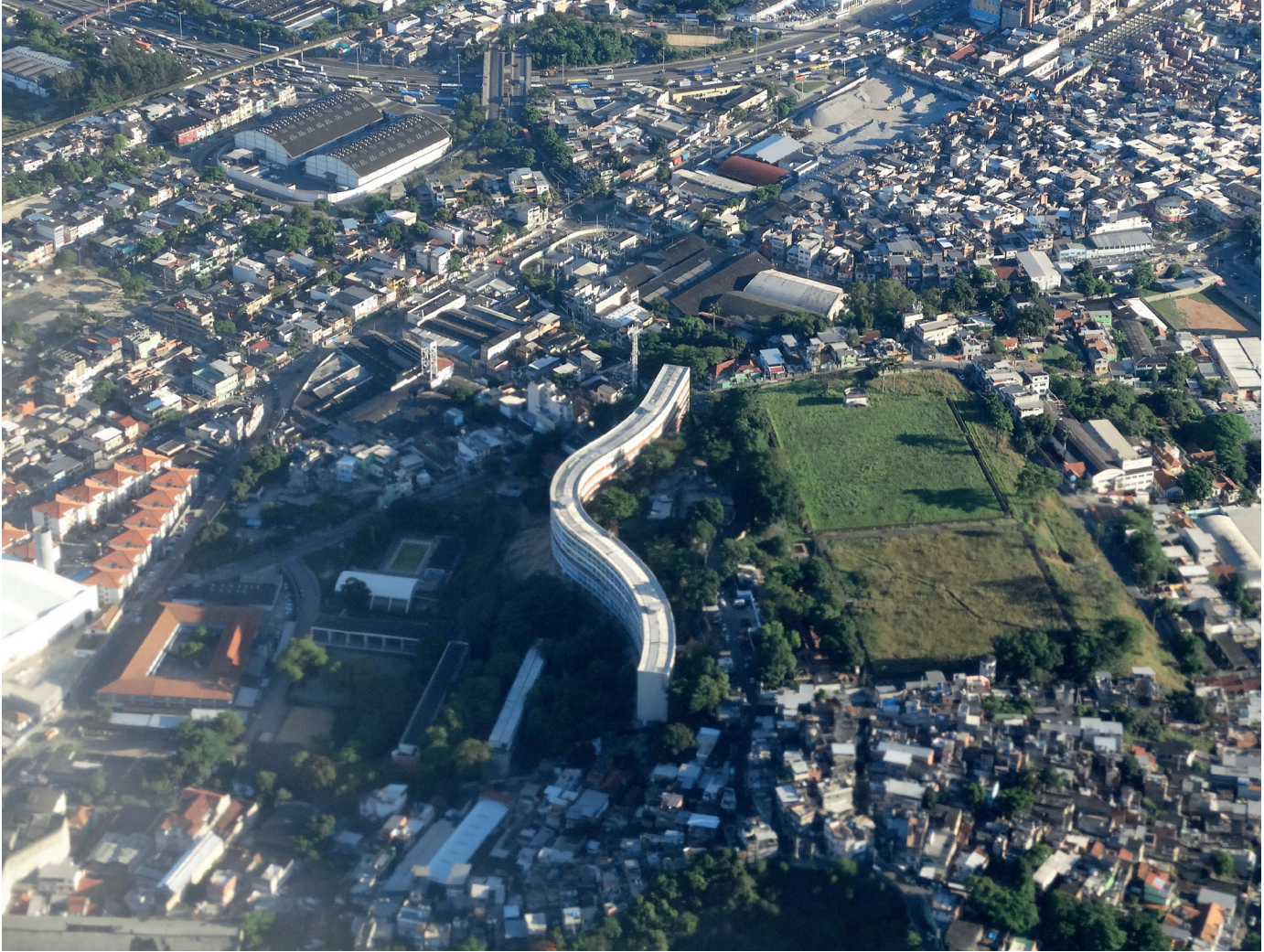
Image 3. Cidade Tiradentes housing complex, built in the periphery of the city of São Paulo in the 1970s