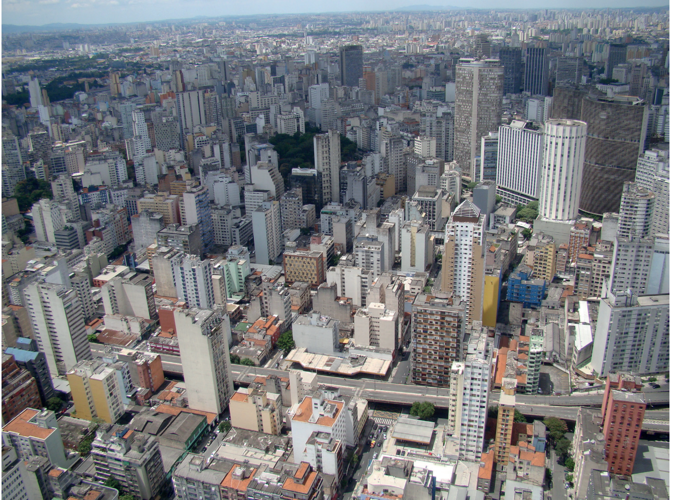
Image 1. São Paulo city center

Source: Prefeitura do Município de São Paulo.