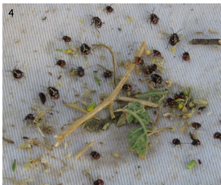
Fig. 4.- Aggregations of B. hilaris during the first sampling.