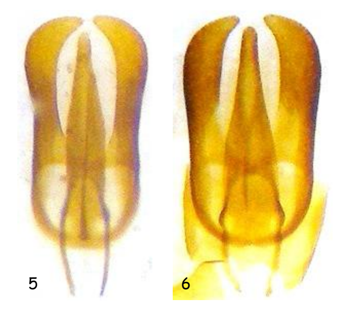
Figs. 5-6.- Genitalia of male: 5.- Anthrenus (s. str.) klichai sp. nov. 6.- Anthrenus (s. str.) kantneri Háva, 2003.

Figs. 3-4.- Antenna of male: 3.- Anthrenus (s. str.) klichai sp. nov. 4.- Anthrenus (s. str.) kantneri Háva, 2003.