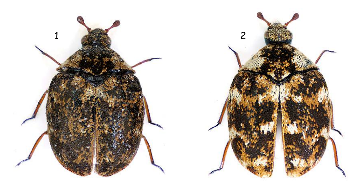
Figs. 1-2.- Habitus of male: 1.- Anthrenus (s. str.) klichai sp. nov. (Holotypus). 2.- Anthrenus (s. str.) kantneri Háva, 2003.

KADEJ, M. & HÁVA J. 2016. A new species of Orphinus Motschulsky, 1858 (Coleoptera, Dermestidae) from Tanzania. African Entomology, 24 (2): 432-436.