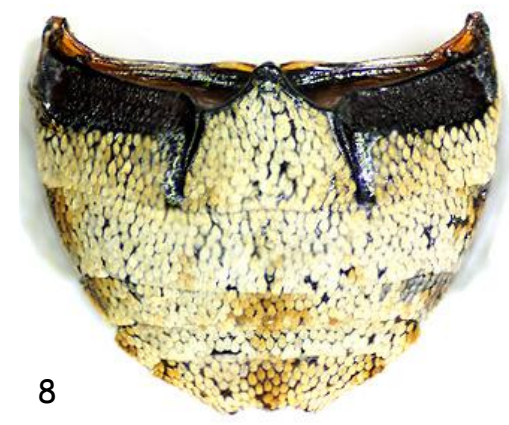
Figs. 7-8.- Abdomen of male: 7.- Anthrenus (s. str.) klichai sp. nov. 8.- Anthrenus (s. str.) kantneri Háva, 2003.