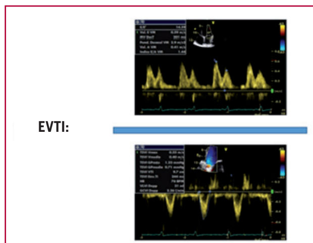
Fig. 2. EVTI: Relationship between the mitral flowgram E wave velocity and the left ventricular outflow tract velocity time integral.

Color Doppler has its limitations. It can be misleading in acute severe regurgitations, evidencing apparently small jets due to limited atrial compliance.