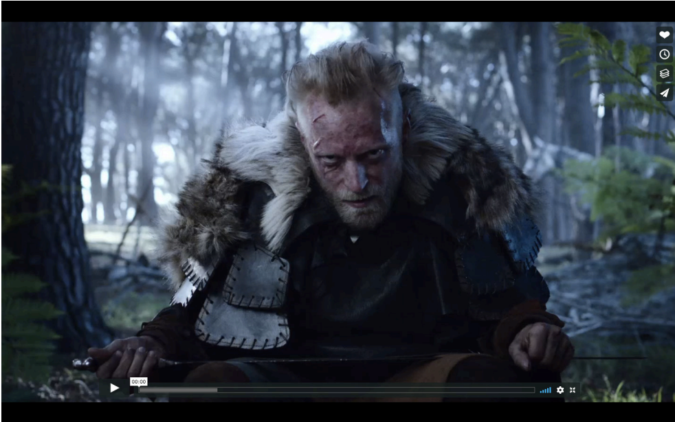
Figure 2: https://vimeo.com/135006750

Ancestry 'Come Find Me' Commercial depicting a Viking inviting viewers to discover who their ancestors were and 'where their story began'. This advertisement also prioritizes the suggestion that GATs can link modern individuals to specific historical populations that feed into ideas around nationhood and identity.