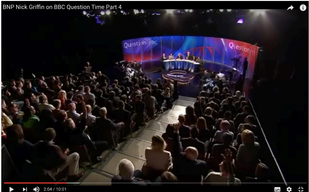
Figure 3: https://www.youtube.com/watch?v=bQE0QPfLfs A 20-minute clip of BBC Question Time from 22 October 2009, featuring the then-leader of the British Nationalist Party, Nick Griffin. At 09:07, Nick Griffin refers to the idea of a British 'indigenous' population that has persisted for the last 17,000 years, a claim that originates in previous studies of modern DNA (Oppenheimer 2006) that have now been refuted (Olalde et al. 2018).

individual's deep ancestry means that in most cases their individual genetic stake in archaeological mortuary sites is not particularly meaningful (Ralph and Coop 2013). Individuals recovered from any European cemetery dating to before the ninth century AD will not be the specific ancestors of any local or even national community. The nature of ancestry means that modern nationally or regionally specific ancestry will only begin to emerge in archaeological individuals from the very recent past. As discussed above, GATs mostly reveal that even modern individuals rarely have exclusive recent ancestry in specific nations or geographical regions (Jobling et al. 2016; Panofsky and Donovan 2017). Informed interpretations of GATs, as well as academic studies of modern and ancient genomes, support arguments that no individual's link to a nation or national heritage can be strictly biological, but is a cultural decision that can be based in part on ancestry, which inevitably incorporates