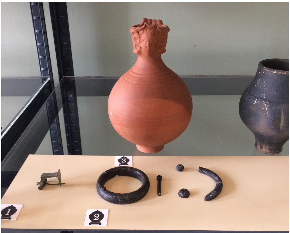
Figure 3: A Roman grave group on display in the exhibition.

early medieval period (Hills 2011: 16). In fact, early Christians had a fascination with people or things that could have once been physically connected with Christ. These items were thought to be imbued with a special significance and thus were highly sought after (Klein 2010: 56). Bachmann (2017: 85) writes that hair jewellery represents a 'private communion between the wearer and the deceased' because only the person wearing the jewellery has intimate knowledge of their relationship with the dead person. There has recently been an increasing prevalence of the use of human remains, such as hair and ashes from deceased loved ones, in the creation of jewellery (Penny Stynes pers. comm.). This was referenced in this exhibition by a pendant containing human ashes in resin created in 2016 (Figure 5). Although methods of creation of such objects may have changed, the principle of keeping a part of a dead loved one close to the living has persisted.