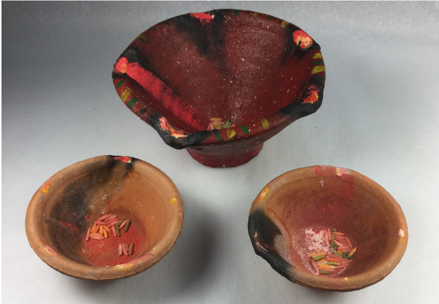
Figure 1: The vessels recovered vessels from the river Colne.