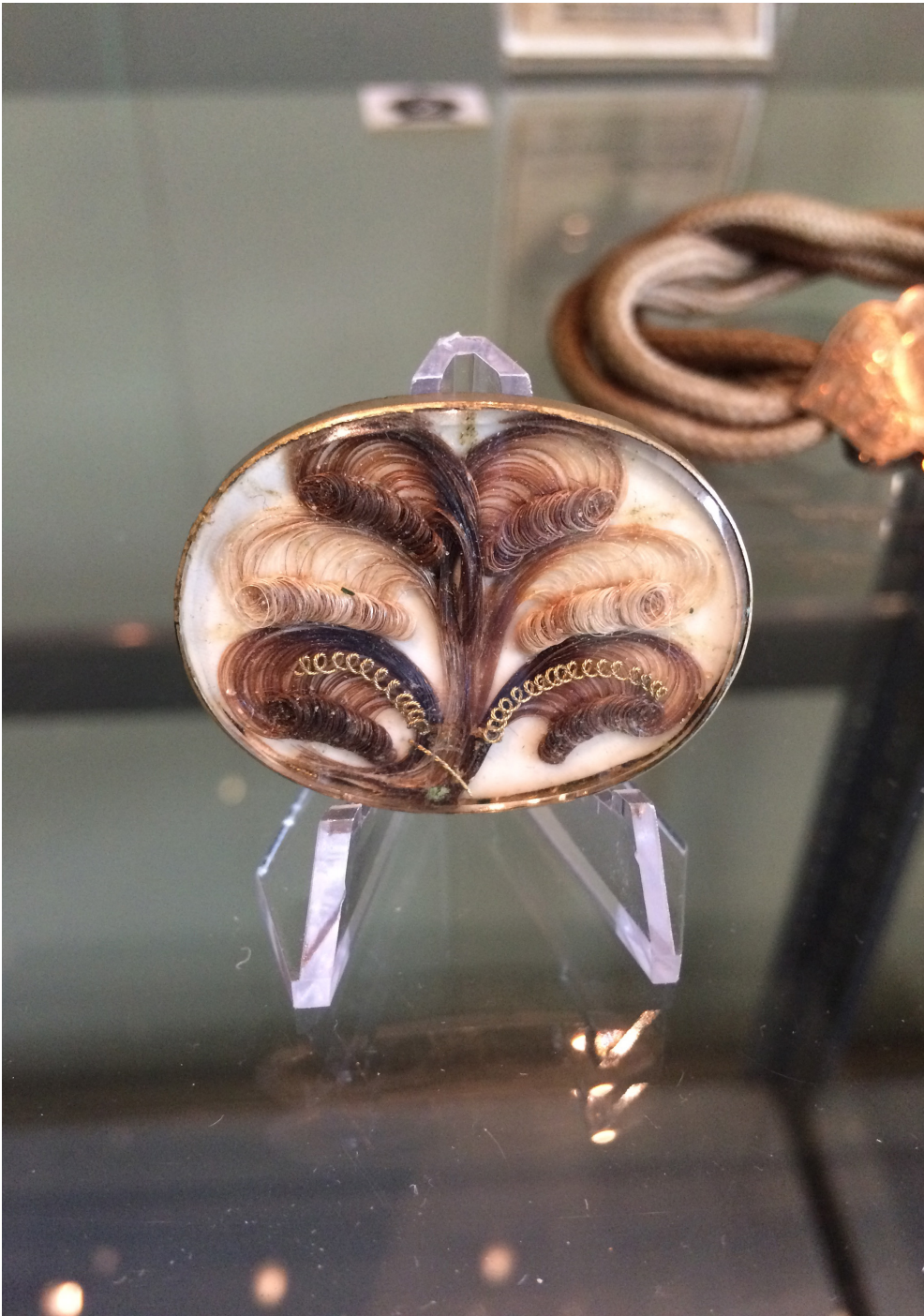
Figure 4: A Victorian brooch with Human hair.