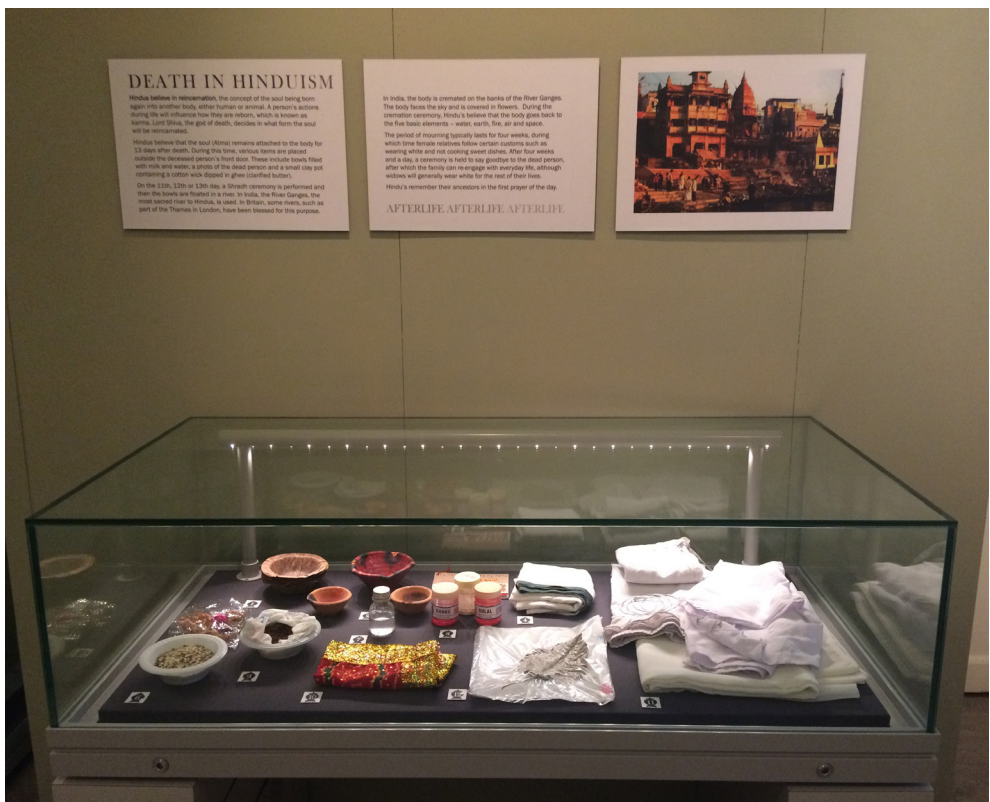
Figure 6: The display case for the "Death in Hinduism" section.

memories, thoughts and feelings triggered by the exhibition. Initially conceived as a similar device to an exhibition comment book, this journal soon started to take on a more personal and emotional nature. As it was not structured like a traditional comments book, with spaces for names, addresses and comments, visitors began to share their experiences and thoughts on death with each other (Figures 7 and 8) by replying to, and/or challenging other people's comments. The evolving nature of the journal led the curators to see it as an important insight into the way people visiting the museum could engage with an exhibition about a challenging topic. These insights could then be used to inform future exhibition programming, and better understand the needs of visitors to such exhibitions. Therefore, Collections Working Group at the museum will now consider the journal itself for accession into the permanent collection.