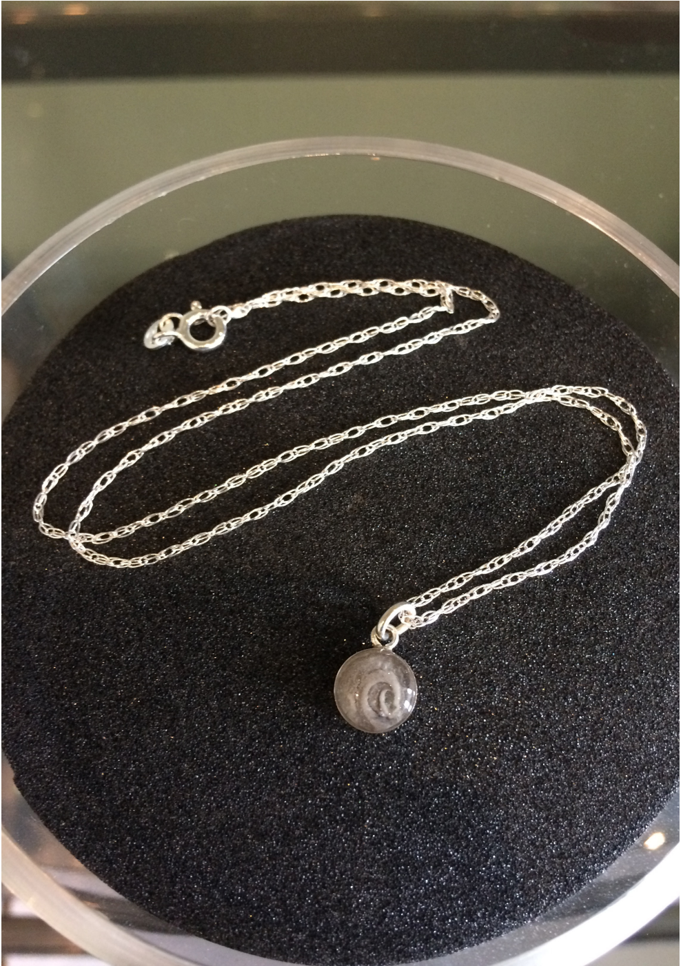
Figure 5: A silver pendant made using human ashes encased in resin.