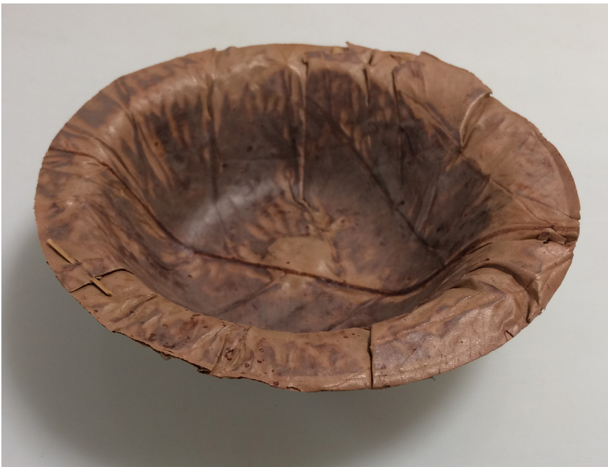
Figure 2: Hindu leaf bowls.