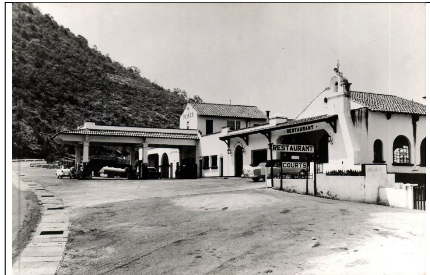
Figure 2. "Resort" service station at Jacala, Hidalgo, Mexico.