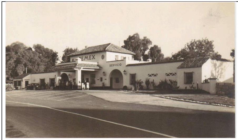
Figure 1. Dobb's Gas Station at Ixmiquilpan, Hidalgo, Mexico.