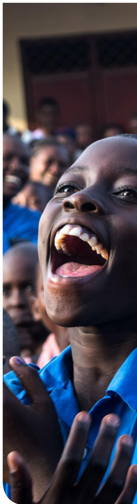
Figura 2: Sin título, fuente: Pixabay.

During the final stages of the same project, University of Duhok trainers developed and delivered workshops on peacebuilding thought to faculty from the University of Mosul who were displaced to Duhok because of Mosul’s continued occupation by Da’esh. This cooperation between public universities -- one of them operating under the authority of the Kurdistan Regional Government’s ministry of higher education and the other answering to Iraq’s federal ministry of higher education -- served as a significant public signal about possibilities for cooperation across the political divide even while remaining out of