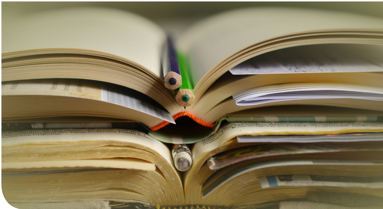
Figura 3: Sin título, fuente: Pixabay.

and ideas are likely both to be generated and to be transferred effectively to the policy process." Envisioning Kelman's interactive problem solving as an educational process provides a model for how CTE might play a role in shifting societal norms in the direction of conflict transformation. Although inclusion of CTE at all levels of formal and informal education might seem to be a worthwhile objective, focusing on learners with the greatest likelihood of applying its lessons to policy development would be a better use of resources. As Lederach (2005) argues, "[i]n social change, it is not necessarily the amount of participants that authenticates a social shift," but rather "the quality of the platform that sustains the shifting process that matters" and that "the focus on numbers has created a misunderstanding and misapplication of the concept of critical mass" (p.89).