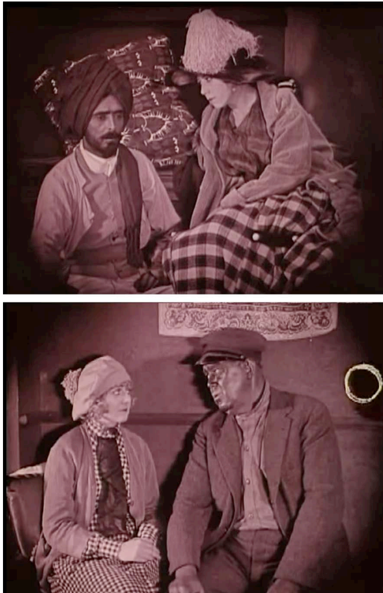
Figure 7. White women and non-white men, depicted in Broken Blossoms .

The following wide shots captures the clients of this establishment, with a languishing, laughing woman at the centre of the composition. We then see her in close-up, as she closes her eyes, evoking a drug-induced trance. Placing young, presumably English women in such treacherous environment reflects the fear of miscegenation and is even more revealing in the complete absence of white men. Consequently, the sequence evokes a virulent belief that non-white immigrants constitute a threat to the white civilization, whether the peril they carry is a sexual threat or moral corruption (Koshy 2001: 52).