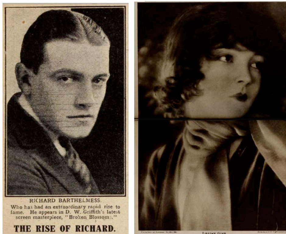
Figure 3. Photographs of Barthelmess and Gish from British fan magazines. From the left: The Picture Show (20 th September 1919) and the poster featured in the same title on 9 th of May 1920

Broken Blossoms develops a parallel narrative of Lucy (Lilian Gish), an English girl abused by her violent father, Battling Burrows (Donald Crisp). Not unlike Cheng, frail and childlike Lucy is a victim of her circumstances. Her tragic position comes to the forefront in the scene in which one acquaintance warns her against marriage and the drudgery of housewifery it brings; we see how, in another encounter, Lucy is cautioned against the dangers of sex work by two prostitutes – or “ladies of the street”, as the film refers to them. Thus, the narrative highlights the hardships a young girl would have to endure to escape her dire reality (Ebert 2000). The two plots intertwine when Lucy stumbles into Cheng’s shop after a particularly savage beating on the hands of her father. Still a monk, the owner takes pity on her, allowing Lucy to take refuge in his abode. Although the man treats his guest with kindness and affection she has never experienced before, nursing Lucy back to health in a room he decorated with silks, he also subjugates her to his whims.