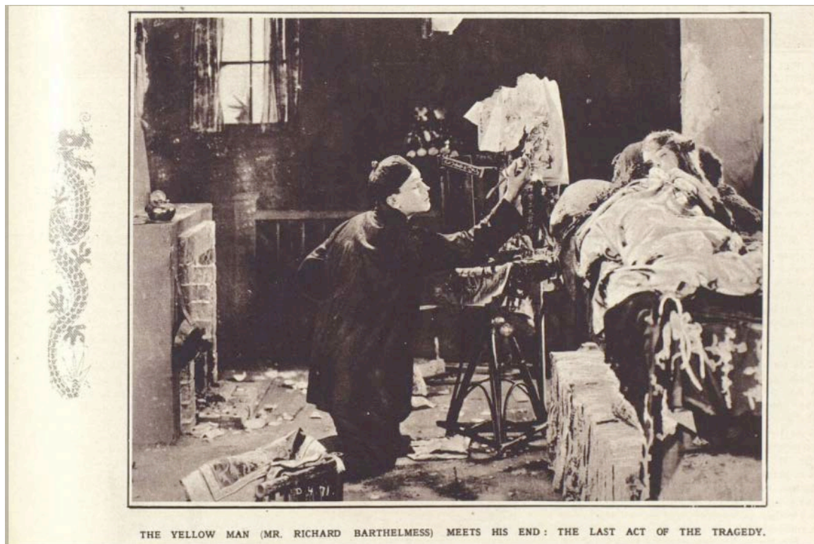
Figure 4. British promotional material for Broken Blossoms .

The working-class heroine is stripped of agency in both of her relationships with men. For her father and tormentor, she is little more than a slave. For Cheng, Lucy epitomises the opposite end of the spectrum: a pure, idealised spectacle; “a white blossom” to which he tends to with special care. Dressed up, adored by exotic fabrics and admired with intensity verging on worship, Lucy resembles a doll rather than a human being. The tragedy hanging over the story becomes imminent when Lucy’s father learns about his daughters’ whereabouts. In the eyes of Battling Burrows, who hated those “not born in the same great country as himself”, his daughter has committed an abominable offence by associating herself with an Asian man. Given the interplay of racial and gender considerations, the ensuing murder can be classified as an honour killing; after all, the perpetrator is convinced that Lucy violated dominant mores of conduct and uses physical violence to control her. In fact, such reading was signalled by an American journalist who referred to Burrows as a man avenging “his family and racial honor [sic]” (1919: 47).