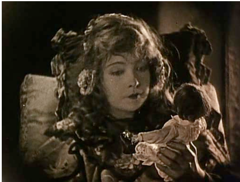
Figure 5. Lilian Gish as Lucy, a Victorian woman-child, looking at her doll

The intended power held by Lucy as a signifier of gendered whiteness, is signalled by one of the film's intertitles, which refers to her as an "alabaster cockney girl." Her representation of femininity is related to the Victorian child-woman, a young female "with tear-aged-face", still childish enough to play with her doll (Figure 5).