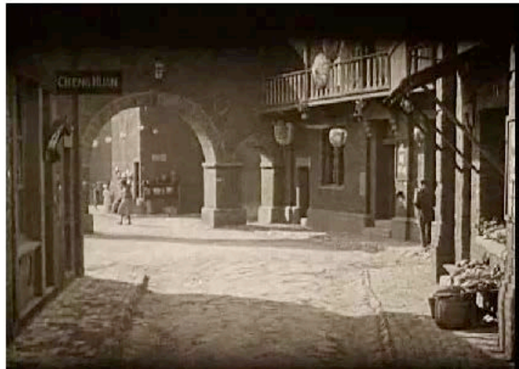
Figure 8. The 'real' Chinatown vs. Chinatown imagined: Pennyfields in the 1920s and the set of Broken Blossoms

Another device connecting Broken Blossoms with the established representational templates is the film's depiction of Limehouse as existing somehow outside of London, understood as a vivid, cosmopolitan centre. This comes across particularly strongly in the set design depicting the haphazard, riverside dwellings of Battling Burrows and his teenage daughter. The squalor of the small, no-window apartment mobilizes the Victorian imagery of the locale, with its "wretched rooms in the most wretched all of the houses" and omnipresent filth (Archer 1865: 134). The evidence provided by film periodicals indicates that such representation was easily recognisable and viewed as authentic by some. The reviewer of The Daily Herald (1920: 8) wrote: