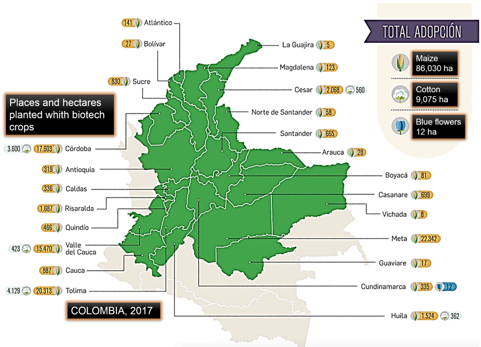
Figure 3: Hectares planted with biotech crops (maize, cotton, and blue flowers) in Colombia during 2017. Adapted from Agro-Bio [66].