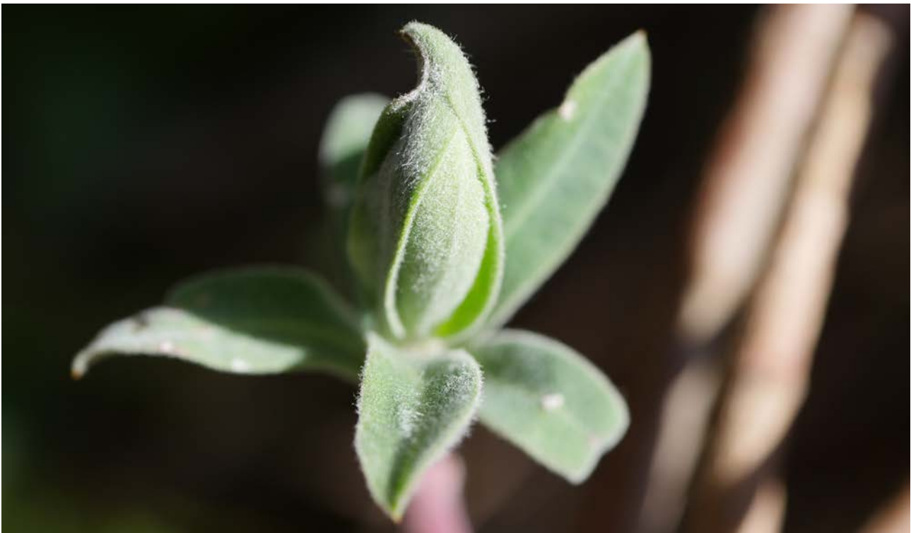
Fig. 1. Young leaves of E. paniculata subsp. calcicola U.Schwarzer & Vicens subsp. nov. from Sagres—Algarve, Portugal—.