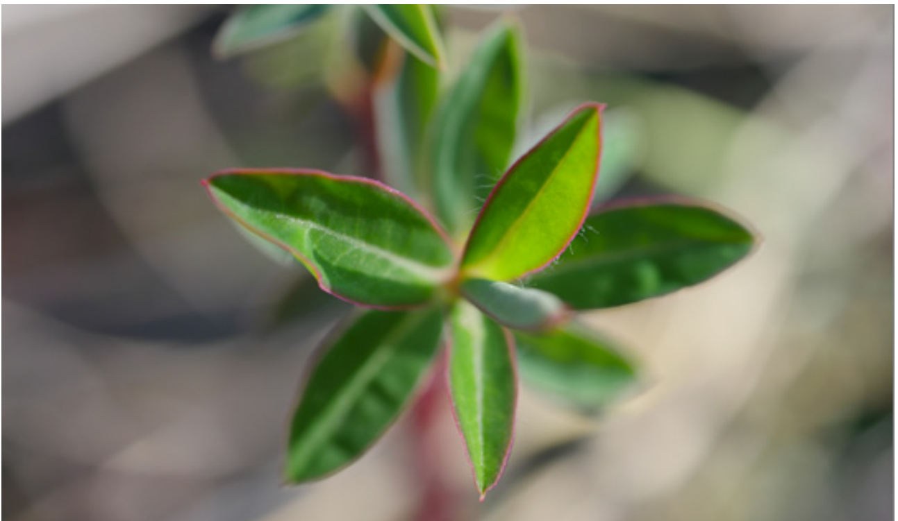
Fig. 3. Young leaves of E. paniculata subsp. monchiquensis (Franco & P.Silva) Vicens & al. from Aljezur —Algarve, Portugal—.