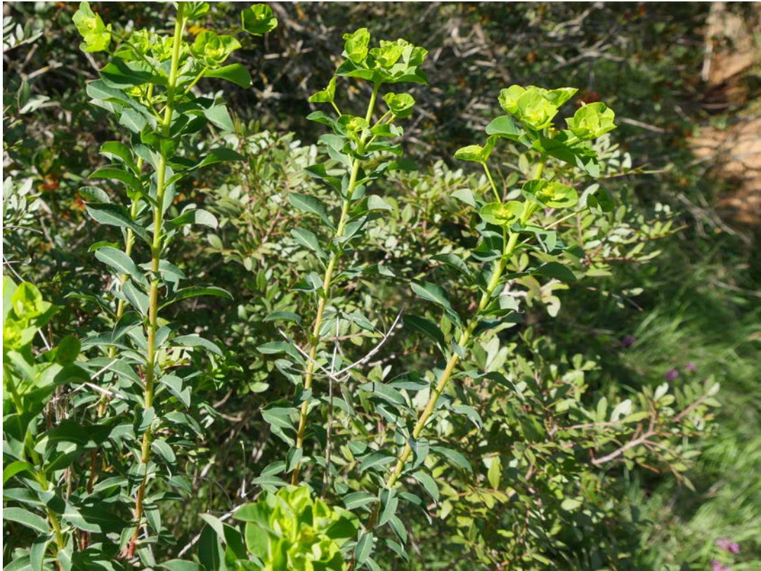
Fig. 2. Habit of E. paniculata subsp. calcicola U.Schwarzer & Vicens subsp. nov. from Sagres —Algarve, Portugal—.