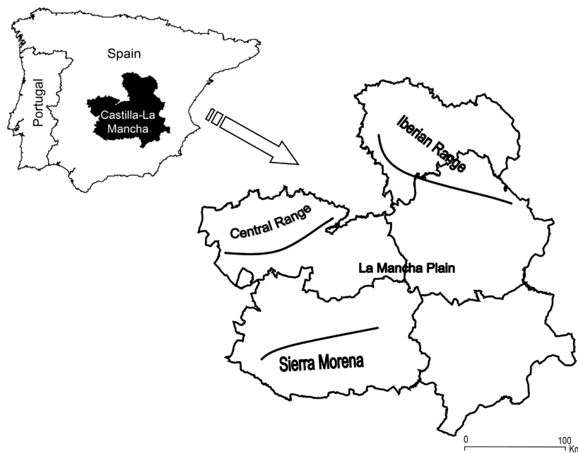
Figure 1. The Castilla-La Mancha region of central Spain showing the positions of the La Mancha Plain and the main mountain ranges and the boundaries of the five provinces.