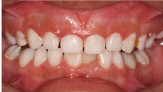
Figure 2d: Clinical appearance immediately after restorations

The posterior teeth also received the necessary and adequate treatment before the patient was discharged.