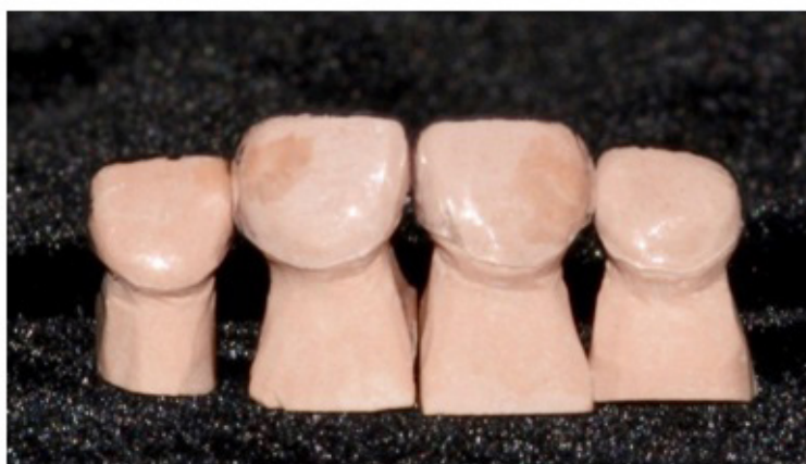
Figure 2a: Troches to make the acetate matrices of teeth 51, 52, 61 and 62