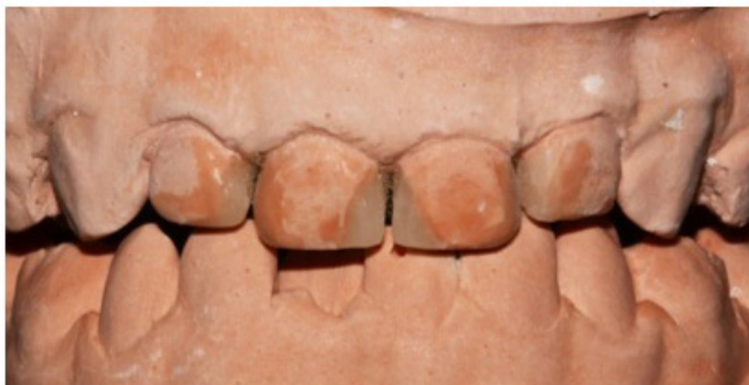
Figure 1c: Top and bottom models with tooth waxing of teeth 51, 52, 61 and 62.

The mold was cast with type IV gypsum plaster and in the respective model, the matrices were made (figure 1d), which were taken to a vacuum plasticizer (Protéctni) with an acetate plate attached to it to make the respective crowns (Figure 2a).