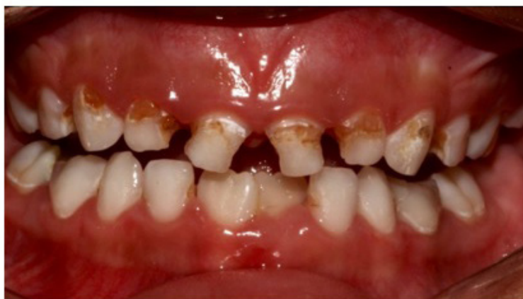
Figure 1a. Initial clinical examination: diagnosis of caries lesions the anterior and posterior teeth in the upper and lower arches.

Clinical examination revealed the presence of carious lesions on the teeth 51,52,53,61,62 and 63, besides those present on the posterior teeth (Figure 1a).