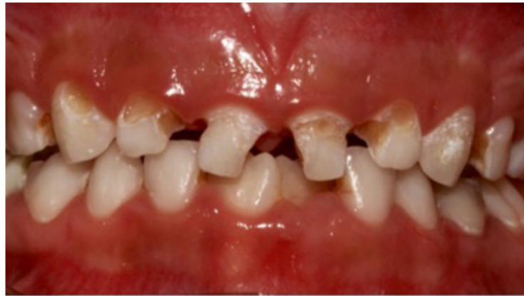
Figure 2b: Clinical appearance of teeth 51, 52, 61 and 63 after removal of carious tissue

Removal of the carious tissue was performed with spherical cutters numbers 4 and 6 (KG Sorensen) at low rotation under relative isolation of the operative field (Figure 2b).