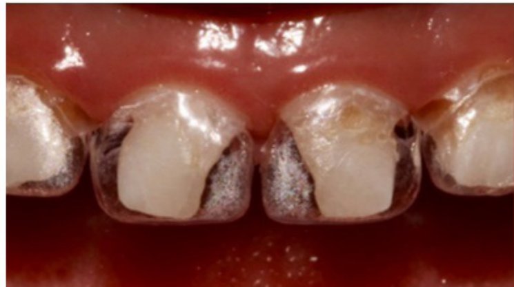
Figure 2c: Adaptation of acetate crowns

The strip crowns were placed on the dental remnants in order to verify their correct adaptation (Figure 2c). Subsequently, conditioning was performed with 35% phosphoric acid (Ultra Etch-Utradent) for 15 seconds in the dentin and 30 seconds in the enamel and delicate drying with the aid of absorbent paper. The adhesive system used was the Adper Scotchbond (3M ESPE) applied according to the manufacturer's recommendations.