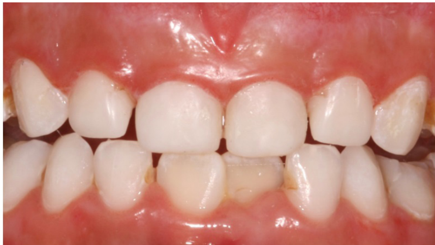
Figure 3. Follow up 6 months after the restorations

The posterior teeth also received the necessary and adequate treatment before the patient was discharged.