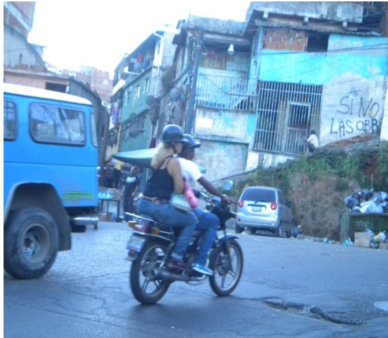
Picture 4 Surrounds of Calle Bolivar