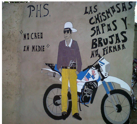
Picture 8 Mural painting of a malandro

* 'P.H.S. (Pura Hampa Seria) – I don't believe in anyone – Gossips, frogs and witches need not apply'