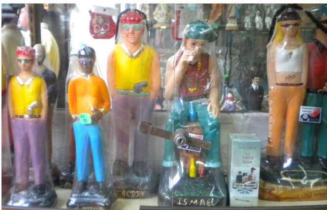
Picture 6 Los Santos Malandros