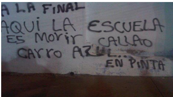
Picture 5 Mural painting in Cumaná

In the end, going to school here is about dying in silence