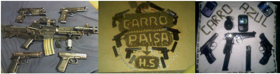
Picture 7 Guns displayed on Facebook

Influenced by this imaginary, malandros always thought others were more ferocious than them. In Cumaná malandros believe their counterparts in the capital are much more violent than them.