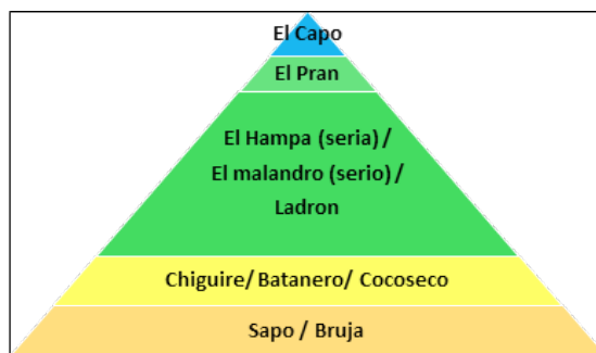
Figure 2. The internal hierarchy of el Malandreo

It is a loose hierarchy, not based on actual organisational structures, but the accumulation of respect. 'El Capo' is the 'invisible delinquent' (Bolívar et al., 2012), the person that controls the drug trade and has connections with law enforcement. In Cumaná he had two visible faces, Cheo Proyectil and Manuel Lanza; leaders of Carro Azul and