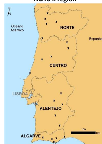
Figure 1 - Creative tourism pilot projects distribution by NUTS II region

One of the specific activities of the CREATOUR project is to put into operation 20 creative tourism pilot projects in small cities and rural areas of Portugal: 5 in the Norte region, 5 in the Centro region, 5 in the Alentejo region, and 5 in the Algarve region (NUTS II level).