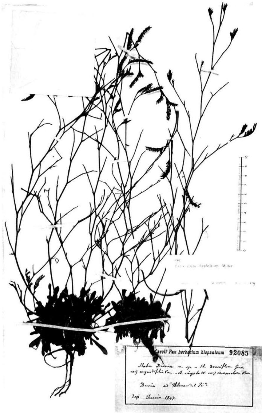
Fig. 1.—Original specimens of Statice dianiae Pau (MA).