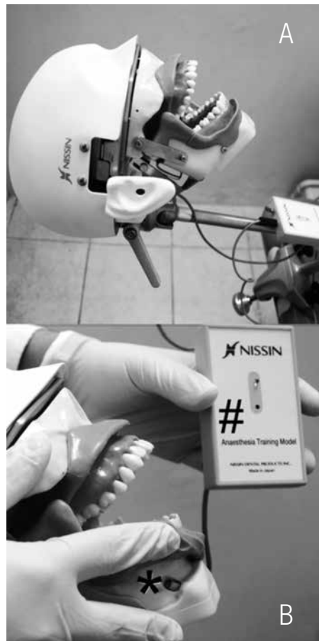
Figure 1. The conduction anesthesia simulation model (CAM) is a typodont with anatomical landmarks including the mandibular ramus. The simulation model is fixed to a phantom head which is then is mounted on the backrest of the dental chair (A). It includes an electronic device (B,#) that produces a signal when the dental needle touches the metallic electronic sensor (B,*).

Table 3 shows the mean scores obtained from the 5-point Likert Scale. A one-way ANOVA test showed significant statistical differences between groups ( p < 0.010 ). Statistically significant differences were noted between G1 and G2 and G1 and G3 with a post hoc test (Table 4).