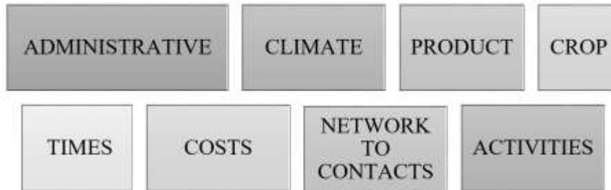
Figure 2: Modules of the functional requirements of the application