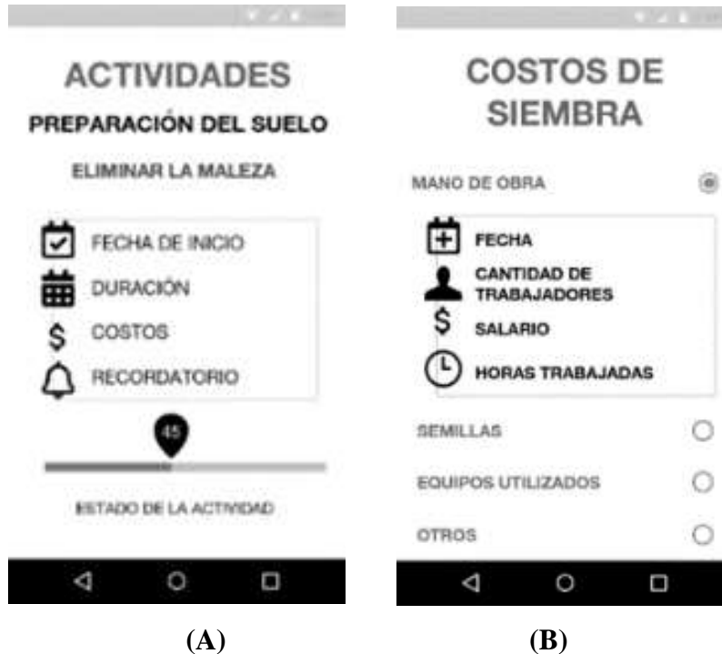
Figure 4(a): User interface for planting activities - App for Figure 4(b). User interface for planting costs