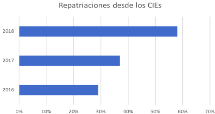
Figure 1. Repatriations from the CIEs.

Compilation based on the reports of the National Mechanism for the Prevention of Torture and Jesuit Service for Migrants (see note 29)