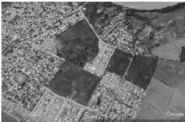
Figure 5. Aerial photograph from May 2, 2017, at an elevation of 284 m, approximately.

The range of Espinal (Qae), originated with the contribution of the Cerro Machín volcano, with a high volcanic content and finer material from the Quaternary Age. This fan, in the