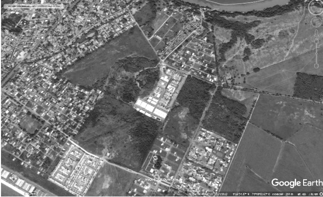
Figure 3. Aerial photograph from February 14, 2012, at an elevation of 284 m, approximately. Source: Adapted from Google Earth.