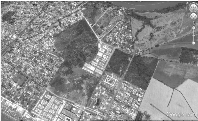
Figure 4. Aerial photograph from July 23, 2015, at an elevation of 284 m, approximately.