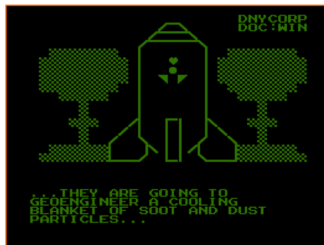
Fig. 9. Still from What remains , "They are going to geoengineer a cooling blanket of soot and dust particles...". Hoorn: Iodine Dynamics.

In the game DNYCorp is distracting people with an epic yet fake alien invasion. The solution they propose is to attack the aliens with nuclear weapons. This will, not coincidentally, generate a nuclear winter, cooling the earth, neutralizing the effects of global warming so people can continue to burn the fossil fuels offered by DNYCorp. The company proposes a technical solution – geoengineering – using the nuclear winter theory, while simultaneously distracting from the cause of the problem. This part of the game is based on the same paper Russell Seitz attacked to defend Reagan's SDI. The TTAPS paper, named after its authors, drew attention to the second order effects of a nuclear attack, the dramatic drop in Earth's surface temperature for a period of weeks to months due to atmospheric dust, causing crop failure (Turco et al. 1983). The infrastructure put in place to promote