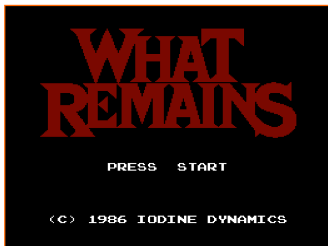
Fig. 1. Still from What remains , "Title Screen". Hoorn: Iodine Dynamics.

This paper does not propose that games or art are the best medium to combat disinformation or to make people immune to the effects of it. This paper describes an art project that shows some of the most successful pre-internet disinformation campaigns and highlights how the online advertisement industry is using them to stave off regulations. The text describes What remains and its underlying research in order to demonstrate how art can use a medium intended for entertainment to address a complex topic with an audience outside the white cube and academia. It is a study of artistic research finding its way into a narrative and physical form that is in line with its conceptual underpinnings. Therefore it is important to involve descriptions of the game, next to the exploration of the different strategies at the base of its narrative. It is outside of the scope of this paper to discuss the choices made within the translation process itself, from historical events to the stages in the game, as this would not leave enough room to analyze and compare the strategies. At this moment no research has been conducted on the effects of the game on its audience. During the development of the project several playtests were held that gave insight into how the game was received in its early stages, but no tests have taken place after completion.