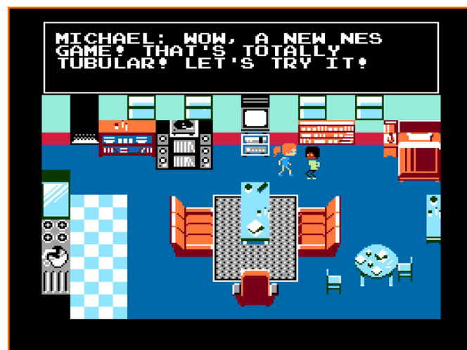
Fig. 2. Still from What remains , "Wow a new NES game!". Hoorn: Iodine Dynamics.