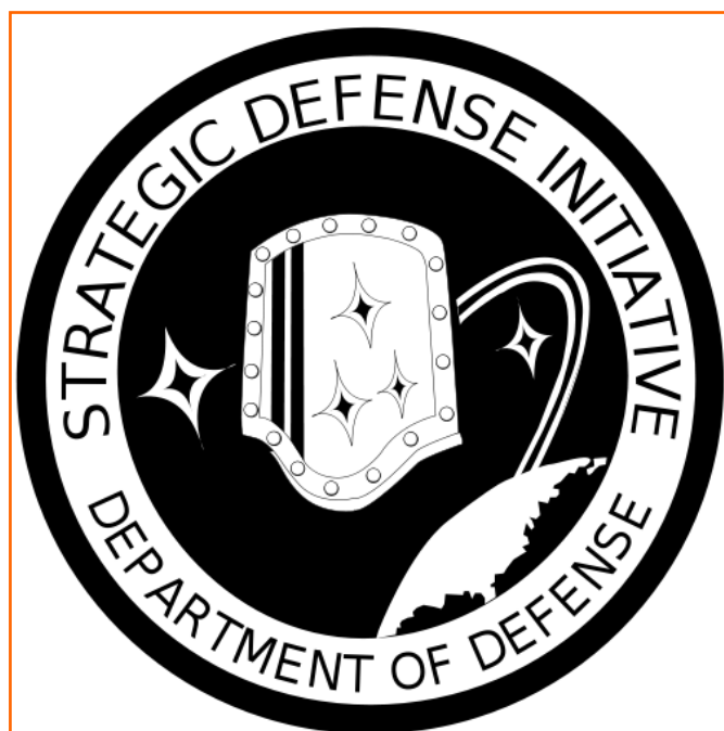
Fig. 8. Strategic Defense Initiative logo, United States Missile Defense Agency, 1983. Available at: https://en.wikipedia.org/wiki/Strategic_Defense_Initiative#/media/File:Sdilog.svg . [Accessed: 15-03-2019]