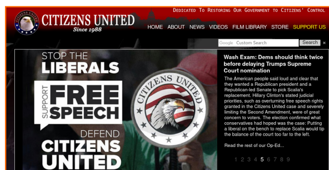
Fig. 6. Screenshot of the Citizens United Website, 2018. Available at: http://www.citizensunited.org . [Accessed: 24-05-2018]

A similar approach was used four years after the CSE was founded, with a much more profound impact. In 1988 Citizens United was founded, again profiling as a grassroots conservative political advocacy group “dedicated to restoring our government to citizens’ control” (Citizens United 2018), acting as a group of concerned citizens, but funded by among others the Koch brothers (Mayer 2017). What started in the 1980s, led to the 2010 Citizens United case against the FEC, resulting in the ruling that the free speech clause in the first amendment prohibits the government from restricting expenditures for political communications by among others corporations and non-profits. This made it possible for the now famous super PACs, and billionaire donors, such as the Koch and Mercer families, to have massive influence on politics ( ibid. ). Citizens United’s focus on free speech and appealing to protecting individual freedom in order to defend a corporate agenda is echoed by the campaigns of the online advertising industry to delay regulation.