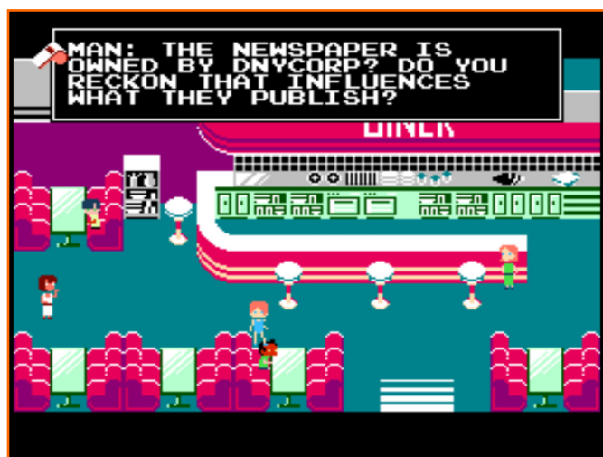
Fig. 4. Still from What remains , “The newspaper is owned by DNYcorp?”. Hoorn: Iodine Dynamics.