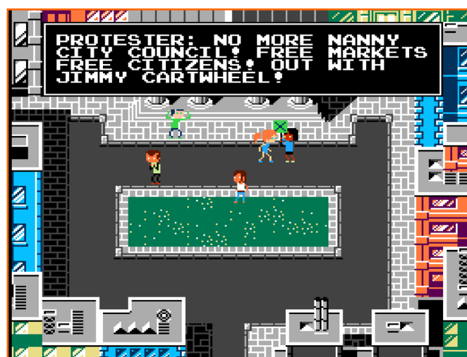
Fig. 7. Still from What remains . “No more nanny city council! Free markets, free citizens!”. Hoorn: Iodine Dynamics.

Inspired by the Koch brothers’ efforts to bootstrap the Tea Party protests, the elections for a new mayor for Sunny Peaks in the game are hit by an anti-tax, pro-freedom, astroturf campaign organized by DNYcorp to get the industry-friendly mayor John Donson elected. You receive information about the scheme and need to convince as many people as possible not to fall for the campaign. You try talking to them about the evidence you have uncovered, but the campaign uses slander against you. You have lost trust. Discrediting news sources, individual journalists and politicians has always been a very effective strategy, it disqualifies the content of any message made public because it is the very source itself that is untrustworthy. Even though you have evidence, you cannot win this battle. Only after uncovering a plan by DNYcorp that threatens the whole world, publishing your discoveries via independent press, radio and television, and infiltrating the secret headquarters of DNYcorp are you able to stop the spread of false information. DNYcorp defends itself with one last strategy.