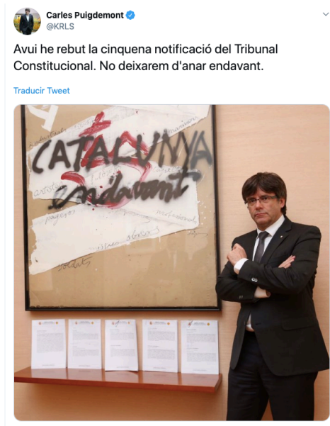
Figure 1: Puigdemont, a rebel against the Constitutional

The antagonist should not be confused with the traitor, that person who sacrifices the common good or cause for personal gain. Although the hero can become a traitor if he changes the destiny of those around him or renounces an exemplary behavior for the cause (Figure 2). Gallardo-Paúls (2016: 89) notes that the Internet user has an 'almost exhibitionist' will and the network's discourse is 'essentially monological, self-centered and egocentric'. The exhibitionist approach fits with the hyper-leadership style favored by Puigdemont. Consequently, he tends to make undiplomatic statements, rejects media outlets as mediators and oversimplifies complex analyses.