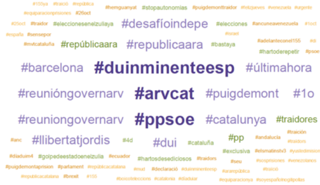
Figure 5: Tag cloud (the greater the font size, the greater the importance)

#duinminenteesp (Espejo Público, Antena 3) and #Arvcat (Al Rojo Vivo, La Sexta), the conversation's most relevant hashtags, referred to news programme content broadcast before midday. La Sexta's hashtag #reuniongovernarv figured among the most cited twice, the digital reality being more important than the audio-visual content per se, i.e. users continued to share the hashtag, even though it did not now have anything to do with the content originally broadcast by the channel.