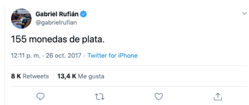
Figure 2: Rufián breaking the hero frame

The last element involves tailoring a narrative without scientific rigor or conceptual precision. Reason, legality or facticity collapsed; legitimating conspiracy theories breed for pro-independence audiences. It is an epic narrative that places the accent on action, rather than on reflection or on the consequences of the decisions made. The hero acts on an ethical impulse. The undesired repercussions affect the hero's reputation and the success of his mission. The former president bases his political activity on agitation on SNSs and through social movements which have retweeted his messages to such an extent that he has created his own information ecosystem. Hallin (2019) believes that this new media ecology is essential in the mediatization of populism: