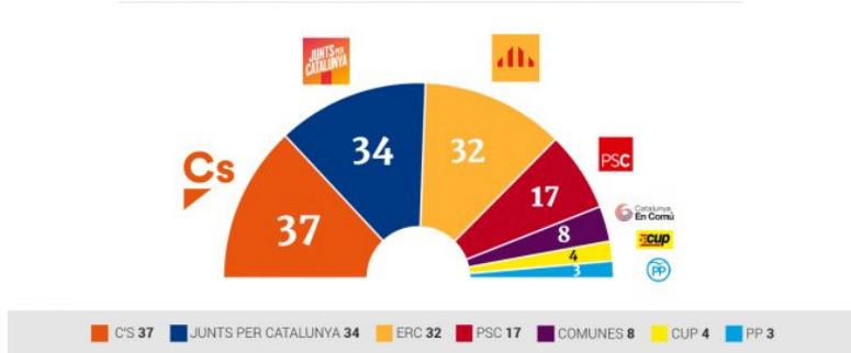
Figure 3: Catalan Elections results (21st December 2017)

The political hero takes the shape of a populist leader, a vague concept that operates on four levels: appeals to the people, anti-pluralism because society is homogeneous, access to power and attacks on the institutional liberal order (de la Torre, 2010; Müller, 2016). In political communication, the construction of the narrative of the hero is a rhetorical and stylistic resource that is resorted to during electoral campaigns, social mobilisations and 'political affectivity' (Arias Maldonado, 2016). As stated above, the role of social media in today's news media environment contributed to profile Puigdemont as a leader of the cause, a state-man, not a traditional politician. The self-image signals the consolidation of a united nation stigmatizing pluralism. Under the circumstances of digital narrative, Puigdemont's attitude fits with the conspiracy theories, where Spanish and European institutions work together against the Catalan independence. Attacking these institutions (Figure 1) he sends a message of "Catalan people" unity against the foreign institutions. As other populist leaders, Puigdemont neglects trust in media, as social media structure his own message without intermediaries.