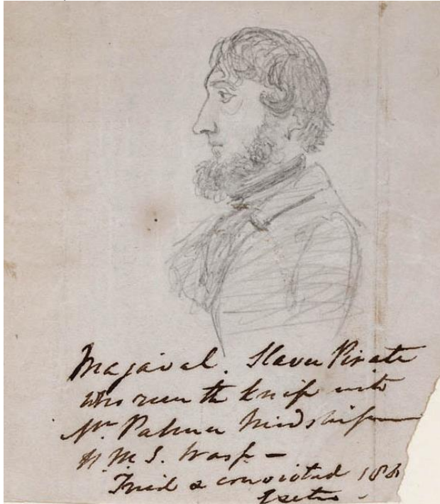
Figure 3: Janus Majaval, unknown artist, 1845