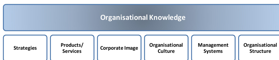
Figure 1. Organizational knowledge.

A large portion of organizational knowledge is connected to information repositories in the form of stored documents across the company (Static Knowledge). This knowledge was initially rooted in the workers’ heads (Dynamic Knowledge). Still, as a relevant organizational asset, the organization feels the need to create mechanisms to store such knowledge in different formats, such as text files, presentation slides, spreadsheets, email messages, and wikis, among others. These documents are a common source of information about the organization, and represent the organizational knowledge, embedding the strategies, products or services, corporate image, management systems, and the organizational structure, as reported in Figure 1.