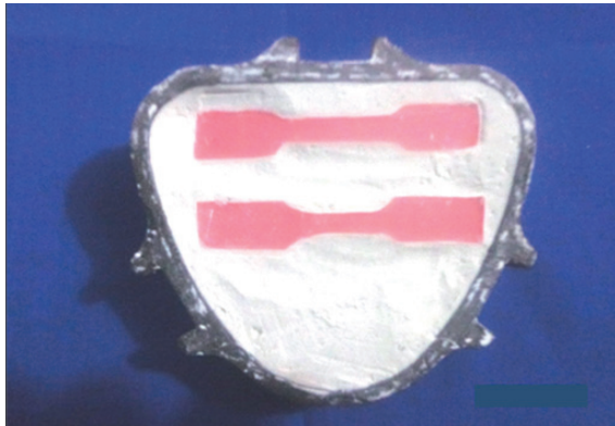
Figure 1. The wax pattern inside the mould.