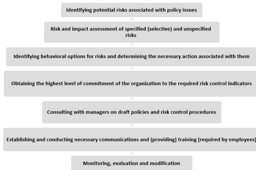
Figure 3. Steps of human resource risk steps and procedures (Stevens, 2015)