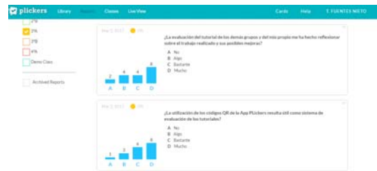
Figure 1. Screen capture of the results filed in the Plickers application

The questions on the assessment instruments are entered on the Plickers application website prior to session 8, so that in the session dedicated to the assessment students can read the questions and assessment answers on the digital screen. The process followed with each item is as follows: (1) the teacher presents the question on the screen; (2) students respond in real time to each of the questions by orienting their QR code as explained (Figure 3); (3) the teacher scans the QR codes with their mobile device; (4) the results are recorded on the Plickers website for subsequent export to «Excel» format and the statistical analysis of the data with the «SPSS 20.0» program. Figure 1 shows an example of a screen with the results of two items recorded in the Plickers App.