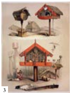
Figure 3: Illustration showing the variety of Pātaka design, "Pātaka, 1840s"

Māori was the term used by the people of Aotearoa at this point in history to identify themselves collectively and vis-à-vis newcomers, whom they named Pākehā . The architecture discussed so far belongs to the Māori . We can conclude that the first thing the people of Aotearoa inherited from their early ancestors was the tradition of voyaging, adaptability and a communal sense of place as identity. Now we transition into a new era of identity and architectural tradition, as Aotearoa begins to be known as New Zealand.