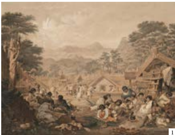
Figure 1: Pūtiki pā, illustration

Pātaka were designed and constructed in a similar manner as rectilinear elevated structures with a gable roof and a porch, serving as communal storehouses. Pātaka are notable for having intricate carvings ornamented with inlaid pounamu * and paua *, which communicated the