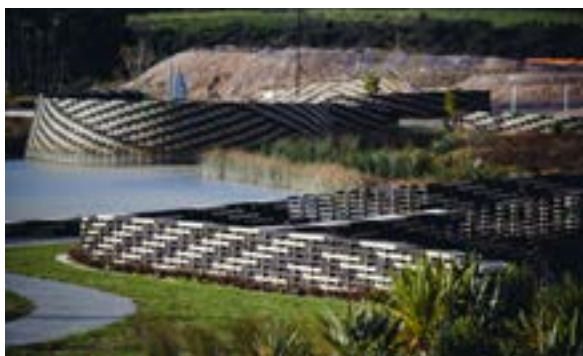
Figure 22: View of Kopupaka reserve

Te Aranga seeks to foster culturally appropriate responses to the built environments of Aotearoa/New Zealand, that are strongly grounded in the concepts of place and belonging intrinsic to Te Ao Māori, the Māori world (New Zealand Institute of Landscape Architects 2016).