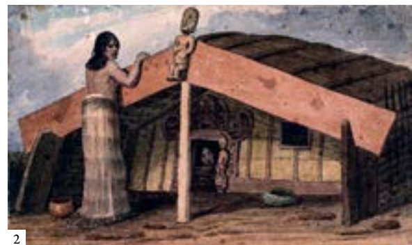
Figure 2: "Wharepuni, Northland" (Te Ara)