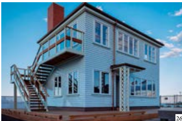
Figure 26: “The Lighthouse”, by Michael Parekowhai

Many years of struggle have carved the way for a bicultural national identity to be publicly accepted long after the