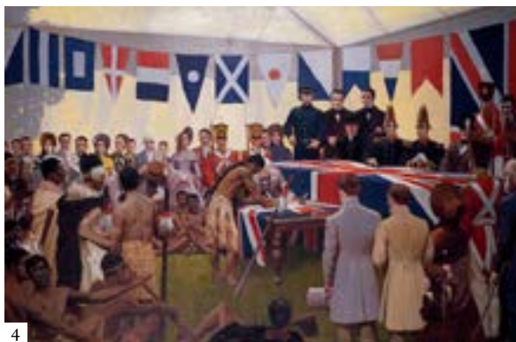
Figure 4: Painting showing the signing of the Treaty of Waitangi in 1840, "Henry Williams and the Treaty of Waitangi", from the Alexander Turnbull Library (Te Ara)

After subsequent expeditions by various European explorers, Captain Cook of Great Britain (1728-1779) ventured to Aotearoa in 1769 and again in 1773 and 1777 (NZ History 2019). The land was claimed in the name of Queen Victoria as New Zealand after the signing of the Treaty of Waitangi – New Zealand's founding document named after the place in the Bay of Islands where it was first signed on February 6, 1840 (Fig. 4). The Treaty is an agreement in Māori and English made between the British Crown and about 540 Māori rangatira *. However, the validity and purpose of this document have been a source of conflict over the years due to differences in translated meanings as well as its nonobservance by the colonial government (New Zealand Ministry for Culture and Heritage 2017). The details and use made of this treaty continue to be debated, with an ongoing dialogue over the nature of the relationship between Māori and Pākehā . 2