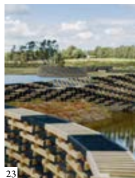
Figure 24 Weaving pattern of river walls constructed with timber