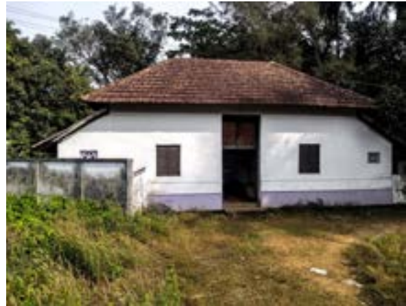
Figure 5: The only remains of Thirumanasseri Kotta, Padippura

Following the Brahmin settlement, a Muslim one linked to trade emerged near the port around the Thottungal mosque (Figs. 6 and 7), to the south.