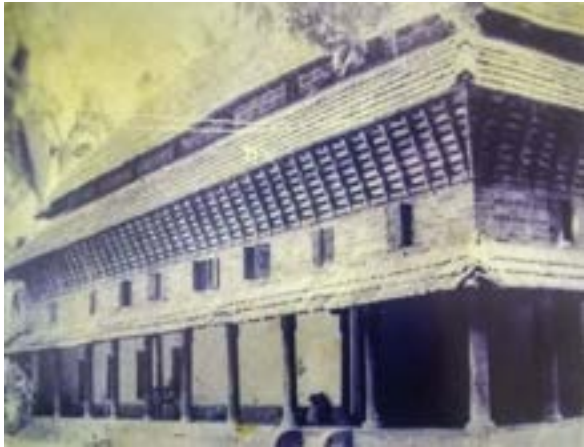
Figure 4: Thirumanasseri Kotta residence of Thirumanasseri Raja, located at Kottathara, Ponnani