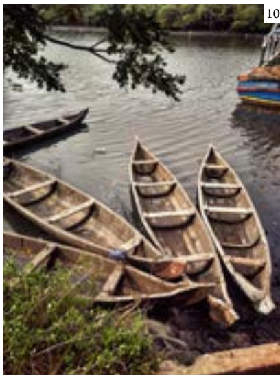
Figure 11: Water birds along the Ponnani Coast