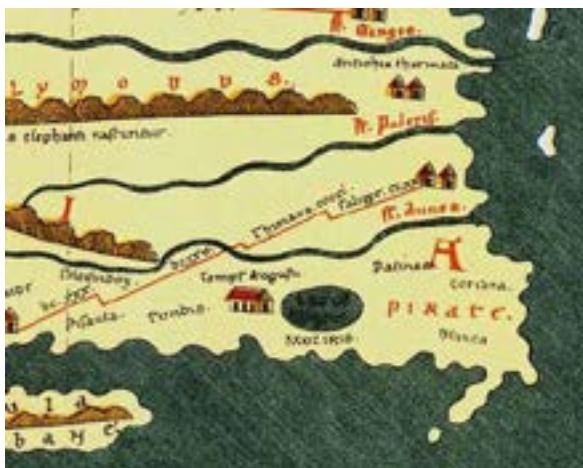
Figure 2: Tundis, as shown in the 4th century Tabula Peutingeriana (Wikipedia)

The remains of a megalith is evidence of a local prehistoric settlement (Fig. 3), and as well as being a center of trade, Ponnani was one of the four earliest Brahmin settlements on the banks of the Bharathappuzha (or Nila) River. Thirumanasseri Raja (king of the independent kingdoms of Malabar region), the Samoothiris , the Dutch, the Portuguese and the British also marked the history of Ponnani. Its architecture evolved in every period.