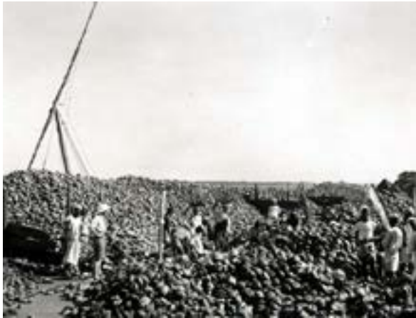
Figure 9: Coconut trade in Ponnani Port (Denkler Gothif)

vessels that sailed to Surat, Mocham, Madras, and Bengal. The more local trade was between Tellicherry and Calicut for supplies of European and Bengali goods. Wheat, meti or fenugreek, the pulses called wulindu , pyru , and avaray , sugar cane, jaggery, and salt were brought from Bombay and Rajapuram, while teak wood and coconut were carried the other way (Fig. 9) (Hamilton 1807).