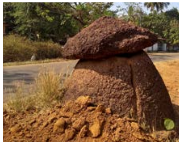
Figure 3: Umbrella Stone: Megalithic monument; Remnants of prehistoric settlement

The Thrikkavu area, to the east of Ponnani, became a well-known Brahmin cultural center, of which remnants in the form of houses and temples are still to be seen. In medieval times, Ponnani was controlled by the Brahmins of Thirumanasseri Natu. The Thirumanasseri kotta (Fig. 4), their palace, was once an imposing structure, but it was later transformed and now only the padippura * gateway (Fig. 5) remains.