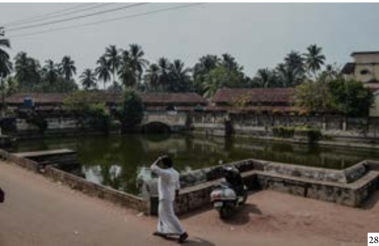
Figure 28: Community water tank (Radhika KM)

Mausoleum". According to Logan, in 1887 there were 400 students at the Juma Masjid Madrasa (Logan 1887).