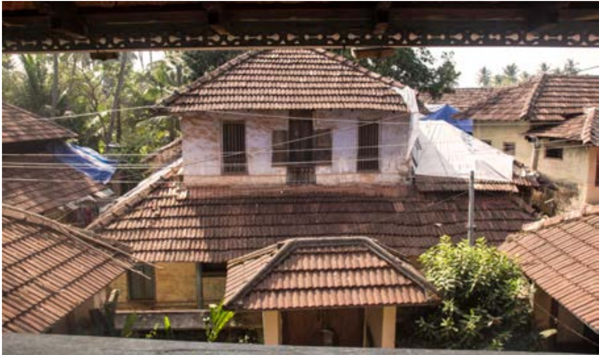
Figure 32: Historic residential area of Ponnani

Ponnani, i.e. Hindus and Muslims. They all follow the same thacchusastra design principles along the main residential corridors (Fig. 32).