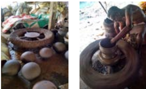
Figure 36: Artisan working on pottery

A 500-year-old tribal community called the Koshavans, which migrated from Andhra Pradesh to Kerala, still engages in its ancestral craft of pottery (Fig. 36). They came to Thirumanasseri Kotta to make the pots used for rituals in the temple in medieval times. Their products were usually sold in Ponnani's Valiyangadi market. Only seven families in the community's present generation continue this craft in view of its low revenues as compared to white-collar jobs and current changes in farming, as they used to take clay from the bottommost layers of arable soil.