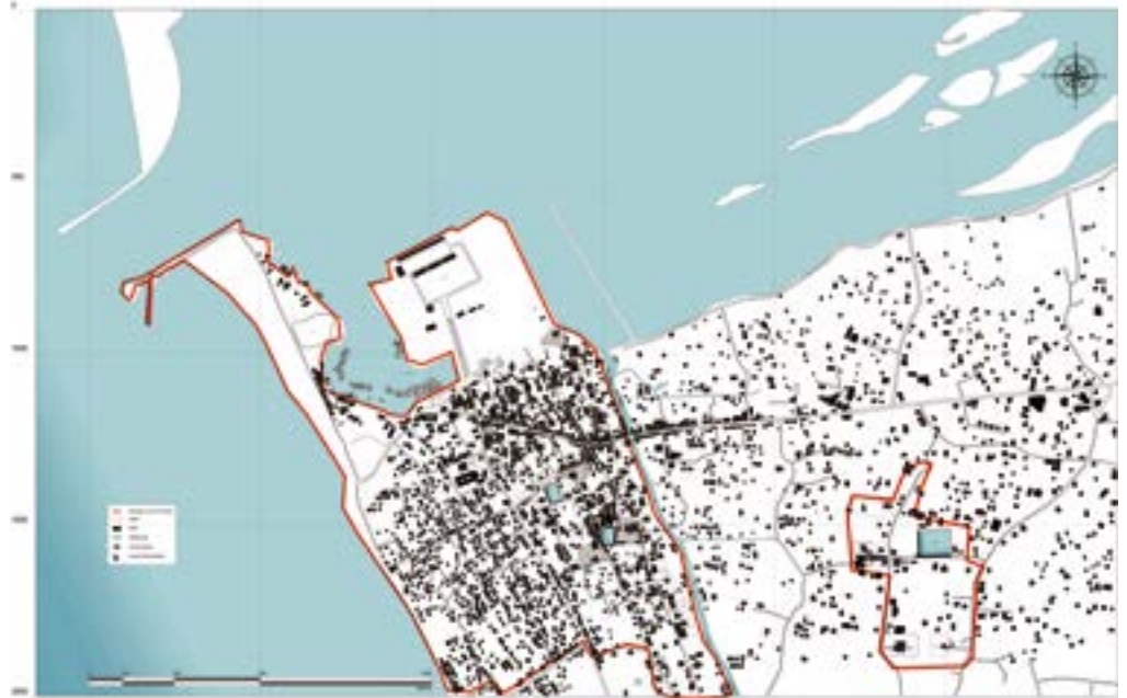
Figure 1: A map of Ponnani showing the traditional areas in red