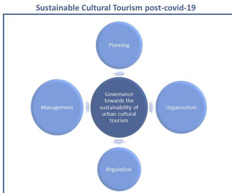
Figure 5. Proposals for sustainable urban cultural tourism post-COVID-19 II

Figure 5 graphically represents the proposals for governance toward sustainability in post-COVID-19 urban cultural tourism.