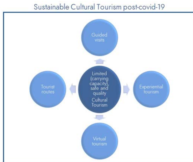
Figure 3. Proposals for post-COVID-19 sustainable urban cultural tourism I

some proposals that should be applied to urban cultural tourism to improve visit quality. These are explained individually, but are actually intertwined: guided visits, tourist routes, experiential tourism and virtual tourism (Figure 3).