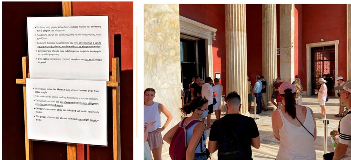
Figure 2. Poster announcing COVID-19 health measures and people waiting outside the National Archaeological Museum of Athens