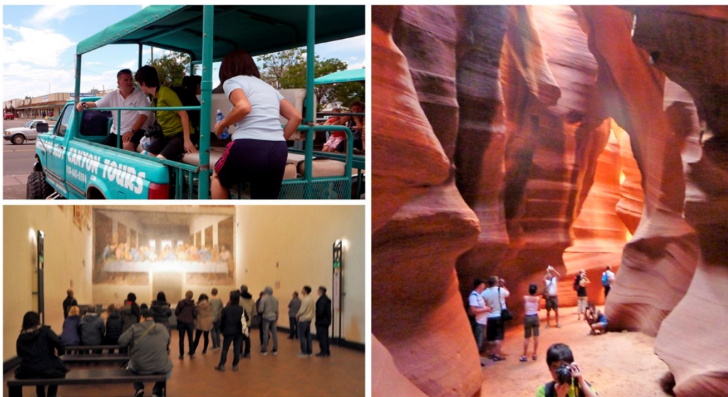
Figure 1. Tourist visits with limited numbers at the Antelope Canyon (Arizona, USA) and the Refectory of the Convent of Santa Maria delle Grazie (Milan, Italy)