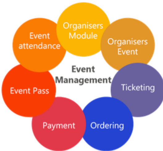
Figure 2: Event Management aspect

Creating an event simply start with ap plan, theme or a goal. From starting the event it should have a clear purpose which will drive speakers, venue and contents. For set up the basics it need to develop an attrarctive website, that defined the event propely. After that it can set the payment so for event the attendees can pay conviniently.