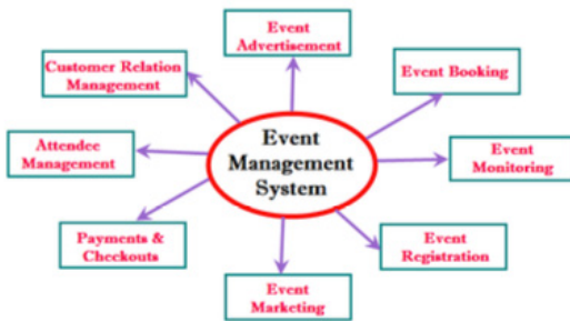
Figure 1: Event Management system

For developing and creating large scale events like weddings, festivals, concerts, conventions, ceremonies, formal parties, conferences it can consider event management as an application of project management. Before actually launching the event it include identification of target audience, coordinating the technical aspects, study of brand and devising the concept of event [1]. From business breakfast meetings to organize the Olympics now included in industry of event management. In order to celebrate achievement, market themselves, raise money or build business relationships many charitable organizations, industries and groups hold the events.