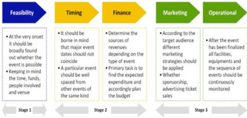
Figure 3: Steps of Event Management Planning