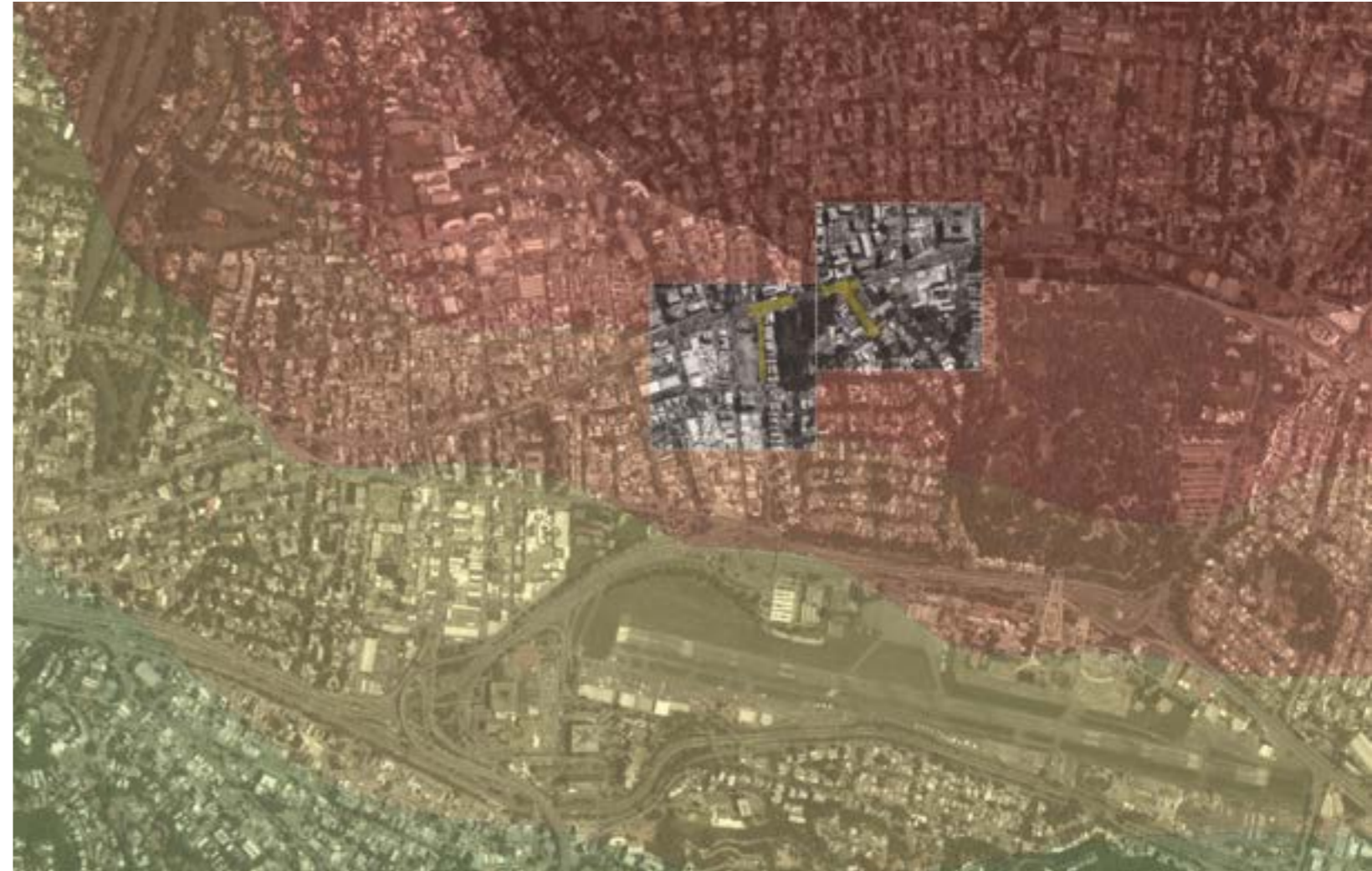
Image 2. Map indicating the area most susceptible to earthquakes around one of the locations selected for the "Concurso de Proyectos Participativos en el Espacio Público" (Altamira, La Floresta, Hotel Monserrat, Ministerio del Poder Popular para el Turismo, Colegio Universitario de Caracas). Darker colors show more susceptible areas and dashed lines underline the specific sites. Based on the sector's soil and previous events. Image by the authors of the contest's proposal, edited starting from: Google Earth, earth.google.com/web .

Among the vulnerabilities that are generally discussed in relation to earthquakes, it is necessary to highlight that almost half of the population of the capital lives in slums