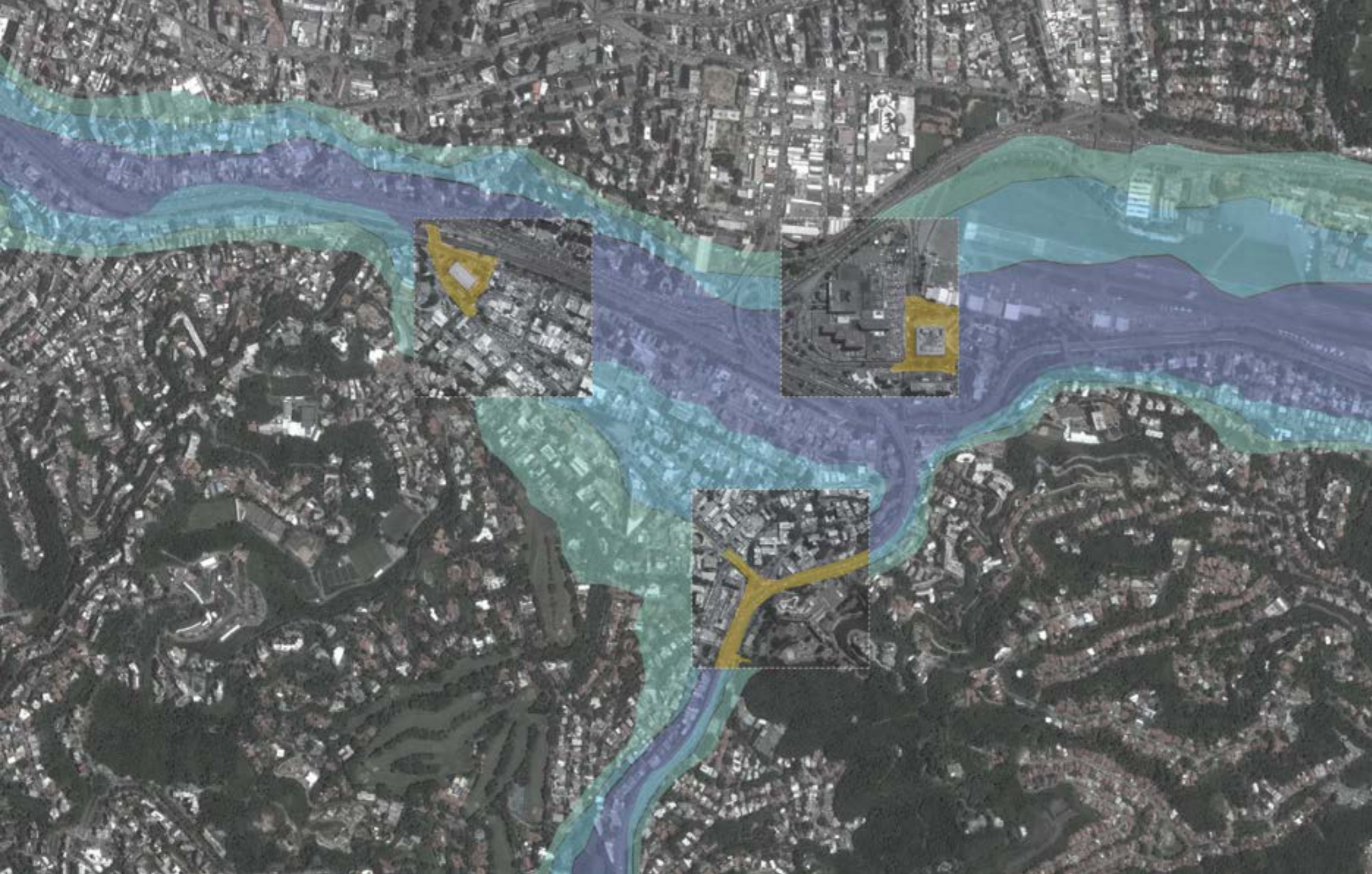
Image 1. Map indicating the area most susceptible to flooding around one of the locations selected for the "Concurso de Proyectos Participativos en el Espacio Público" (Las Mercedes, Chuao, Centro Comercial Las Mercedes, Hotel Tamanaco, Centro Banaven). Darker colors show more susceptible areas and dashed lines underline the specific sites. Based on the sector's topography and previous events.