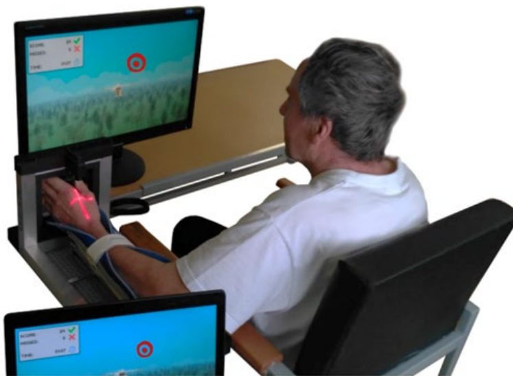
Figure 2. Exercise demonstration of a patient in a rehabilitation facility under supervision. Note: derived from research.

If the patient has achieved enough goals (more than 80 %) in the previous exercise and thus met the expectations, the following goals will be generated more difficult by the constant \alpha = 2\% . For example, after a successful exercise, \delta + \alpha = 77\% of the maximum values for next stage (thus new \delta_n = 77\% ). If the patient achieves results between 45 % and 80 %, \delta_n = \delta in that case. But if the score is less than 45 % during the exercise, the scale is \delta_n = \delta - \alpha , even if the exercise is very problematic and the rate is less than 20 %, then \delta_n = \delta - 3 * \alpha . The game score is created based on the number of captured targets. We can see a sample exercise in Figure 2.