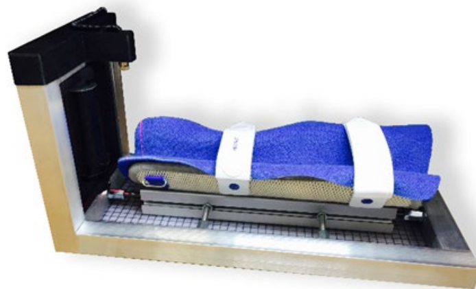
Figure 1. RepaiR device with a measuring part and splint for placing the hand manufactured from low-temperature thermoplastic material LTT. Note: derived from research.

We chose a computer game we developed for assisted rehabilitation. It should be noted at the outset that we used the RepaiR device according to Ferenčík (2018, 2019), which was developed in 2016 at the Technical University of Kosice. RepaiR (Rehabilitation Platform Improvement) is a device designed for computer-assisted rehabilitation and, at the same time, as a diagnostic device for measuring forces in flexion, extension, ulnar, and radial deviation, according to Viegas (1993). The device contains eight strain gauges, which are housed in a handle. During rehabilitation or exercise, the patient develops force on the handle on each strain gauge. The signal from the strain gauges is adjusted by a 24-bit transducer Hx711 with a frequency of 80 Hz. The device can measure the force developed in the range of 0-40 kg. The accuracy of each strain gauge is 0.05 % of sensitivity from the maximum range \pm 0.02 kg. The output from the converters is then processed by the Arduino Mega microcomputer, which is part of the device and is protected from damage. Device can be seen in Figure 1.